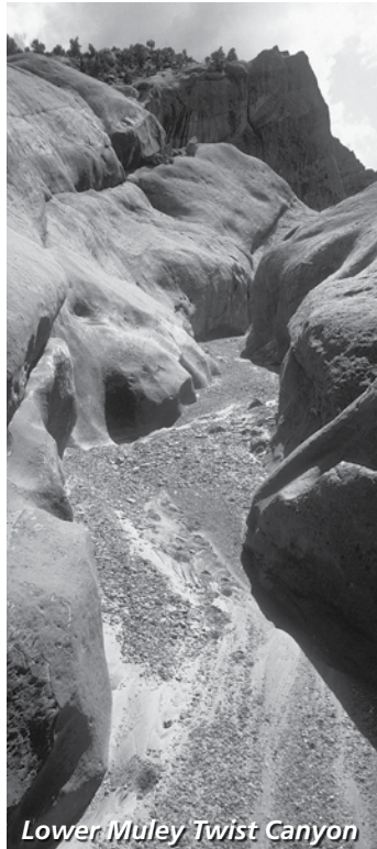
Lower Muley Twist Canyon

The highlight of the hike is a deep, narrow, twisting canyon with large alcoves. The canyon offers many opportunities for side trips and exploring. From 1881 to 1884, the canyon served as a wagon route for Mormon pioneers traveling south toward San Juan County. The canyon was thought to be narrow enough to “twist a mule”, hence the name Muley Twist. The Post cutoff trail is marked with rock cairns and signs, but carrying a topographic map is recommended. It is extremely hot in summer and water sources are unreliable; carry adequate water. Use caution in narrow canyons particularly during flash flood season (typically July–September).