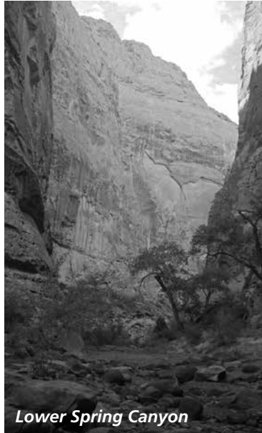
Lower Spring Canyon

Spring Canyon is deep and narrow with towering Wingate cliffs and Navajo domes. It originates on the shoulder of Thousand Lakes Mountain and extends to the Fremont River. The route is marked with rock cairns and signs in some places, but many sections are unmarked; carrying a topographic map and GPS unit is recommended. It is extremely hot in summer, and potential water sources are rare and uncertain (see hike descriptions for details). Use caution in narrow canyons, particularly during the flash flood season (typically July–September).