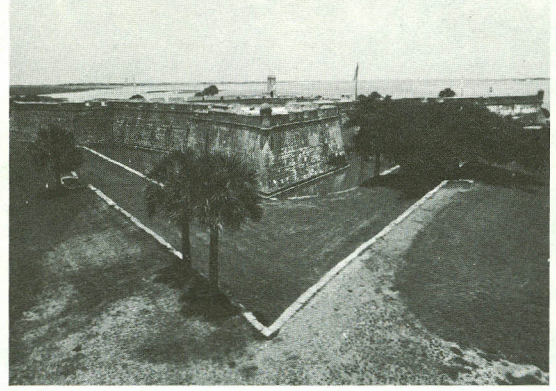
Castillo de San Marcos