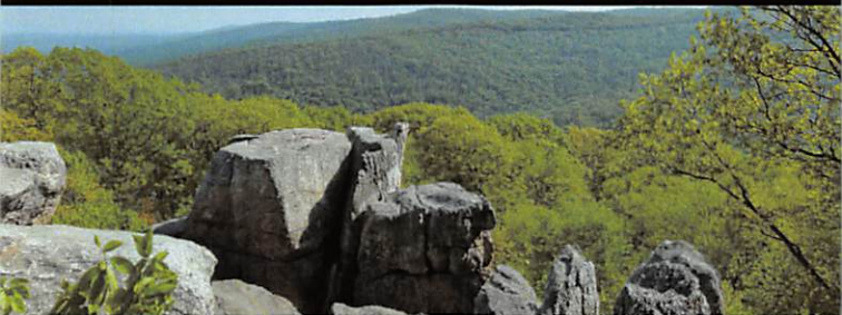
Chimney Rock NPS