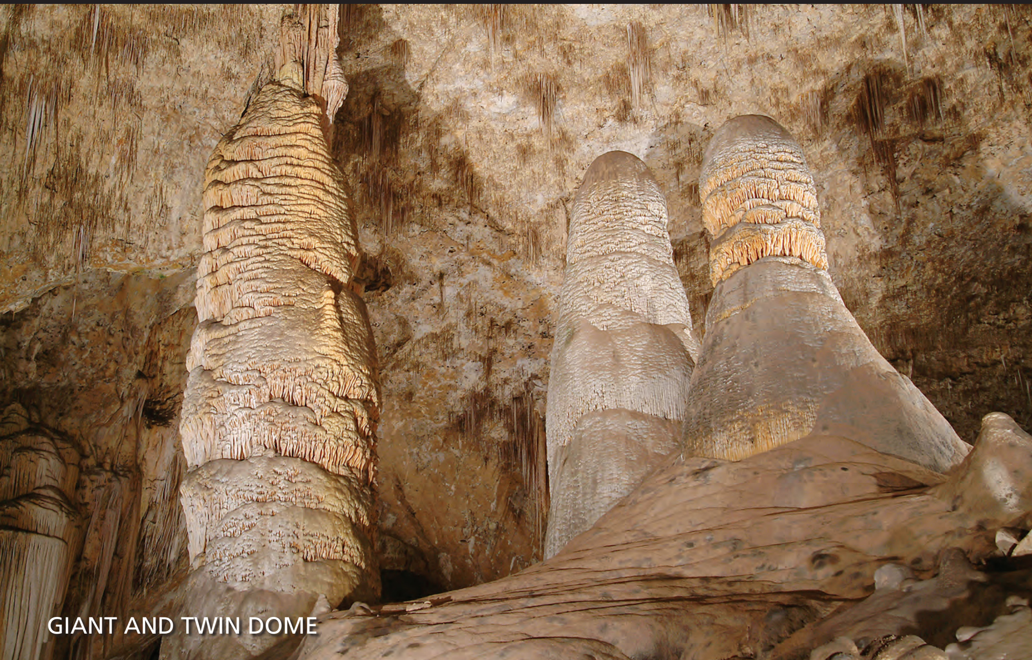
GIANT AND TWIN DOME