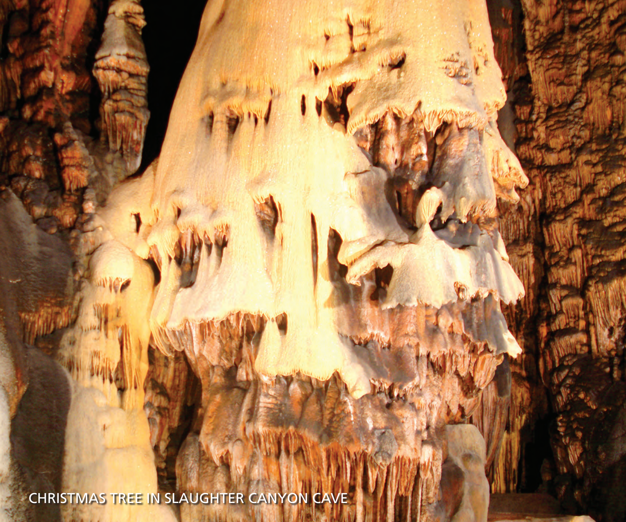
CHRISTMAS TREE IN SLAUGHTER CANYON CAVE

Bat Cave, where they sleep until dusk the next evening.