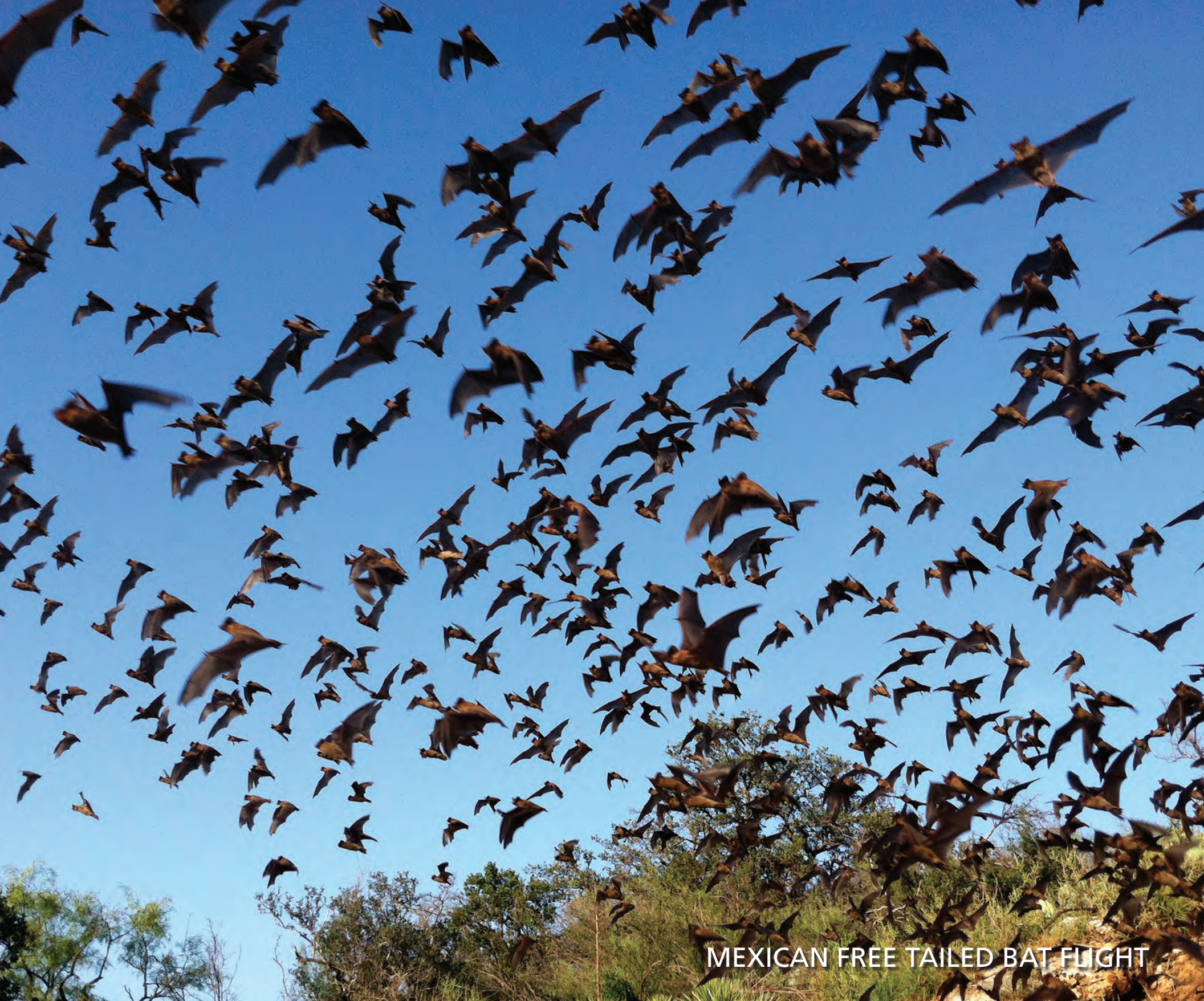
MEXICAN FREE TAILED BAT FLIGHT

in the cave while the adults leave to feed. How does a mother ever find her own baby in the teeming mass of pups? She remembers her pup's location, its scent, and the sound of its cry.