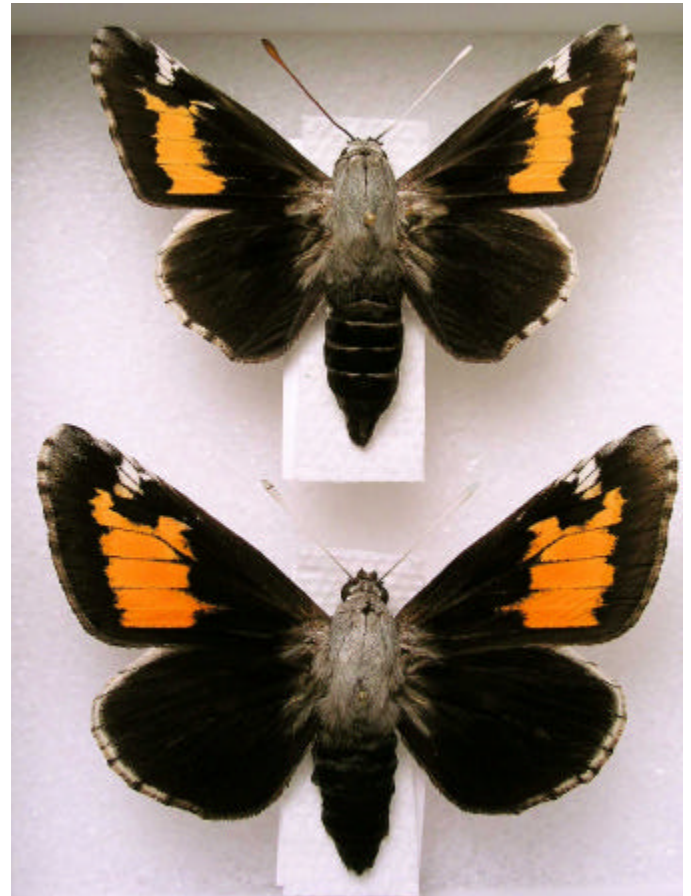
Specimens of Viola's bear giant skipper are pinned with their wings open to show the colors on their upper wing surfaces. The average adult male size is 2½ inches while the average adult female size is 3 inches. The female is below: females are always larger, as they need to fly with many eggs inside.

Two giant skippers—the Carlsbad agave skipper and Viola's bear giant skipper—were first found and scientifically described in CCNP in the 1950s. In the jargon of biology, CCNP is the 'type locality' for each subspecies—and will be forever recognized as such.