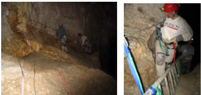
Moving a ladder across the Troll Town traverse.