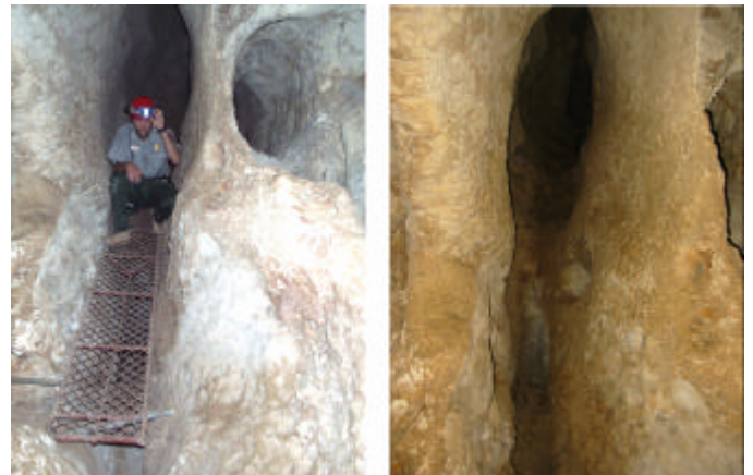
The chain link bridge (13) before and after.

We have begun with the structures near the junction between Right-Hand Fork and the main trail down Left-Hand Tunnel. We started by removing an old chain-link fence bridge (13) and three ladders (15-16) that had been laid down on the ground to make travel easier. The ladders were replaced with a handline. A wooden 2" x 4" (17) used as a brace to hold trail material in place was not replaced yet. We also removed a large amount of old wood and other materials from under the bridge, though there is more cleanup to be done.