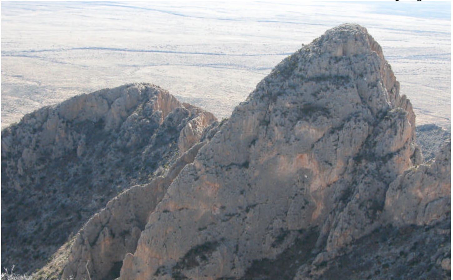
Looking south along a portion of the jagged escarpment edge in the park's designated wilderness.

Edited by Dale L. Pate Proofreading: Paula Bauer