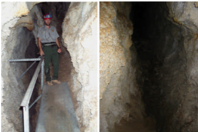
The “erector set” bridge (#14) before and after from opposite views. Note the supports jammed into the aragonite.

and move to the main trail without causing any additional damage to the cave (or the volunteers).