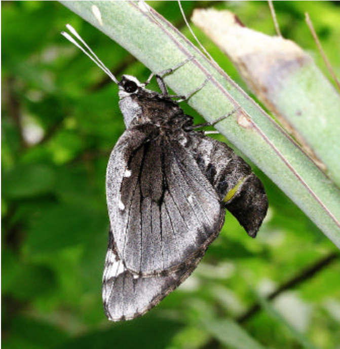
A female Viola's bear giant skipper resting with only her drab underwings showing.

all six checked larval tents contained parasitoids that killed the larvae,” said Grishin, of the University of Texas Southwestern Medical Center at Dallas. “I want to give it some time for parasitoid numbers to decrease, so I do not plan to do any more work in the park before next January.”