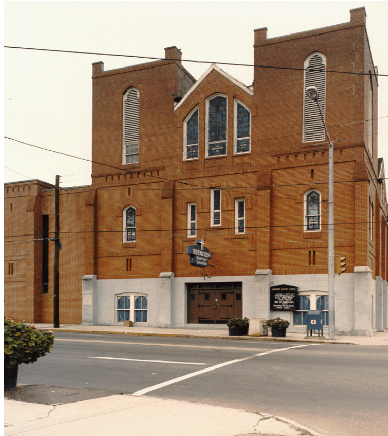
Martin Luther King, Jr. National Historic Site

...when we allow freedom to ring, when we let it ring from every tenement and every hamlet, from every state and every city, we will be able to speed up that day when all of God's children, black men and white men, Jews and Gentiles, Protestants and Catholics, will be able to join hands and sing in the words of the old Negro spiritual, "Free at last, free at last. Thank God Almighty, we are free at last."