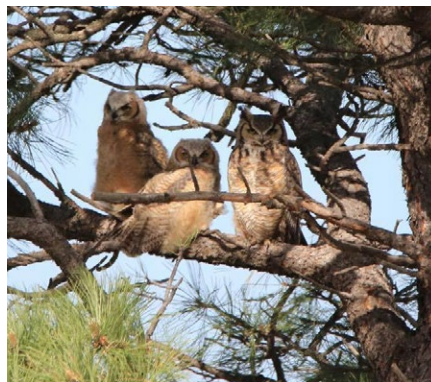
Great Horned Owl and owlets