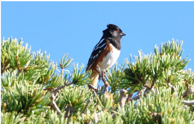
The Spotted Towhee is one of the most common birds seen at Capulin Volcano NM

The Southern Plains Inventory and Monitoring Network is one of 32 National Park Service inventory and monitoring networks that assess the condition of park ecosystems and develop a stronger scientific basis for stewardship of natural resources.