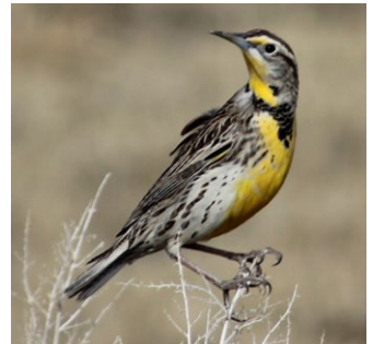
Western Meadowlark