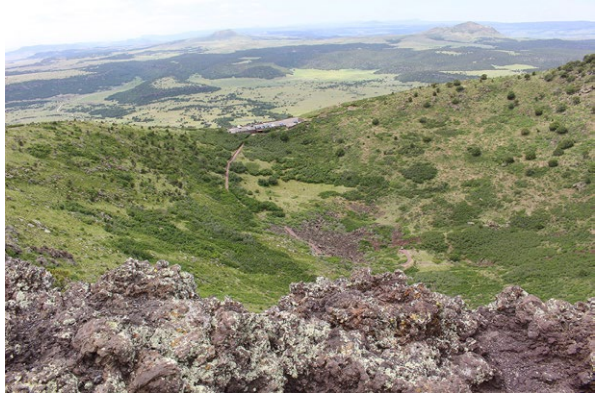
View of Capulin's crater from the Rim Trail. Look for Spotted Towhees, Pinyon Jays, and Ravens during your hike.

Wild Turkeys are sometimes seen in the flats near the visitor center, especially during the fall. The Greater Roadrunner can also be occasionally observed in the monument.