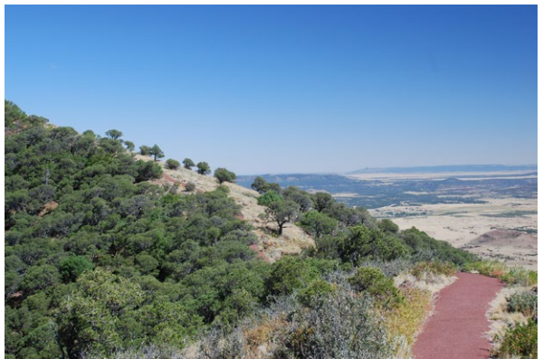
Pinyon pine-juniper woodland along the Crater Rim Trail