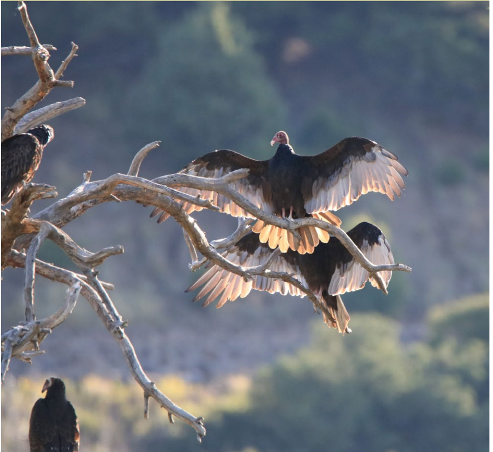
Turkey Vultures exhibiting sunning behavior at Capulin Volcano NM.