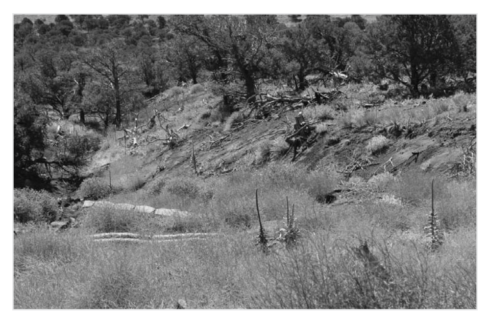
Culvert 14, one of several inadequate culverts, has experienced significant erosion due to heavy rainfall undermining the road to the volcano rim. Notice the exposed cinder.

Although the National Park Service does not like to detour visitors or create safety risks, access to the work sites are very limited due to the steep slopes of the volcano. In order to perform this work, it will require heavy equipment in the roadway during some park hours. The contractor and monument staff will be working together in order to serve the visitors to the best of our ability. The park asks that people understand what problems may persist if this work is not completed.