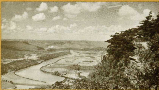
Looking towards Browns Ferry from Point Park.

On the 25th Grant launched Sherman against the Confederate right and sent Hooker from Lookout Mountain to attack the left. Thomas, in the center