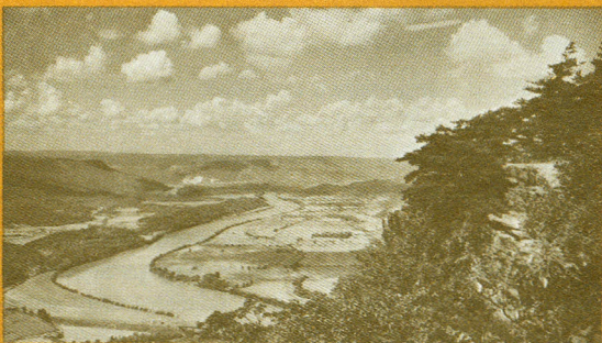
Looking towards Browns Ferry from Point Park.

On the 25th Grant launched Sherman against the Confederate right and sent Hooker from Lookout Mountain to attack the left. Thomas, in the center