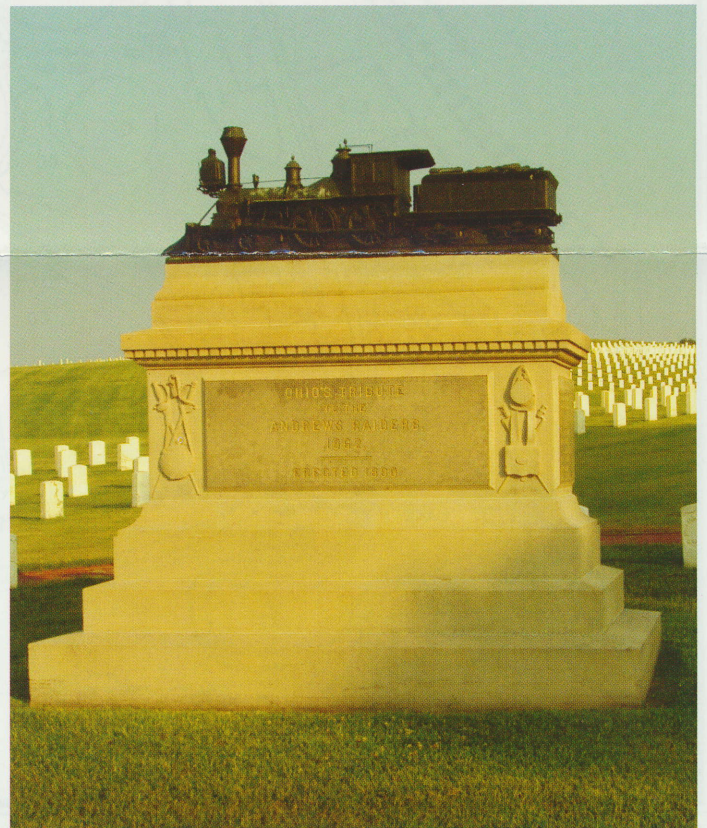
Andrews' Raiders Monument

Passing through the cemetery, visitors often find interesting geological and historical areas that demand time for pause and reflection. There's an obviously old memorial arch on the south side of the cemetery that many believe was the original main entrance. Looking carefully, one can make out an inscription that reads, "Here rest 12,956 citizens who died for their country from 1861 to 1865." (Section