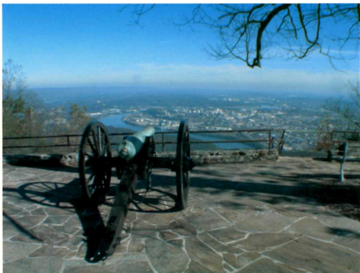
Corput's Battery high atop historic Lookout Mountain at Point Park.

In the late summer and fall of 1863, Union and Confederate armies were locked in a desperate struggle for the city of Chattanooga, the "Gateway to the Deep South." Two major battles were fought over a nine week period, with each side claiming one victory. The Battle of Chickamauga, fought on September 19 - 20, was a Confederate victory and one of the bloodiest engagements of the Civil War with over 34,000 casualties.