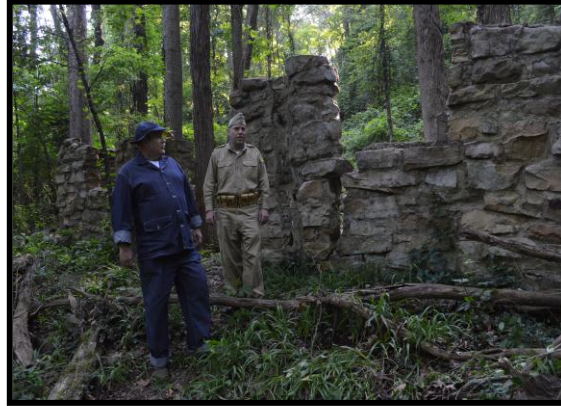
Above: Volunteer living historians portray members of the Civilian Conservation Corps (CCC) at Camp Demaray on Lookout Mountain.

So if you see a volunteer around the park, please take a moment to thank them—and maybe consider joining them in volunteering!