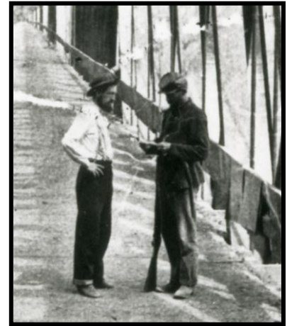
A soldier with the United States Colored Troops checks a civilian's pass before allowing passage in Chattanooga - Chattanooga History Center.

In December 1865, the 13 th Amendment was ratified, and these men and women could legally call themselves free. The Civil War marked the beginning of the black community in Chattanooga, but their struggle was far from over. This fall, the park will partner with the Chattanooga History Center, the Bessie Smith Cultural Center, and local historians to conduct a program on the 150 th Anniversary of the 13 th Amendment. The next program will take place at the Walnut Street Bridge on December 6 at 3pm.