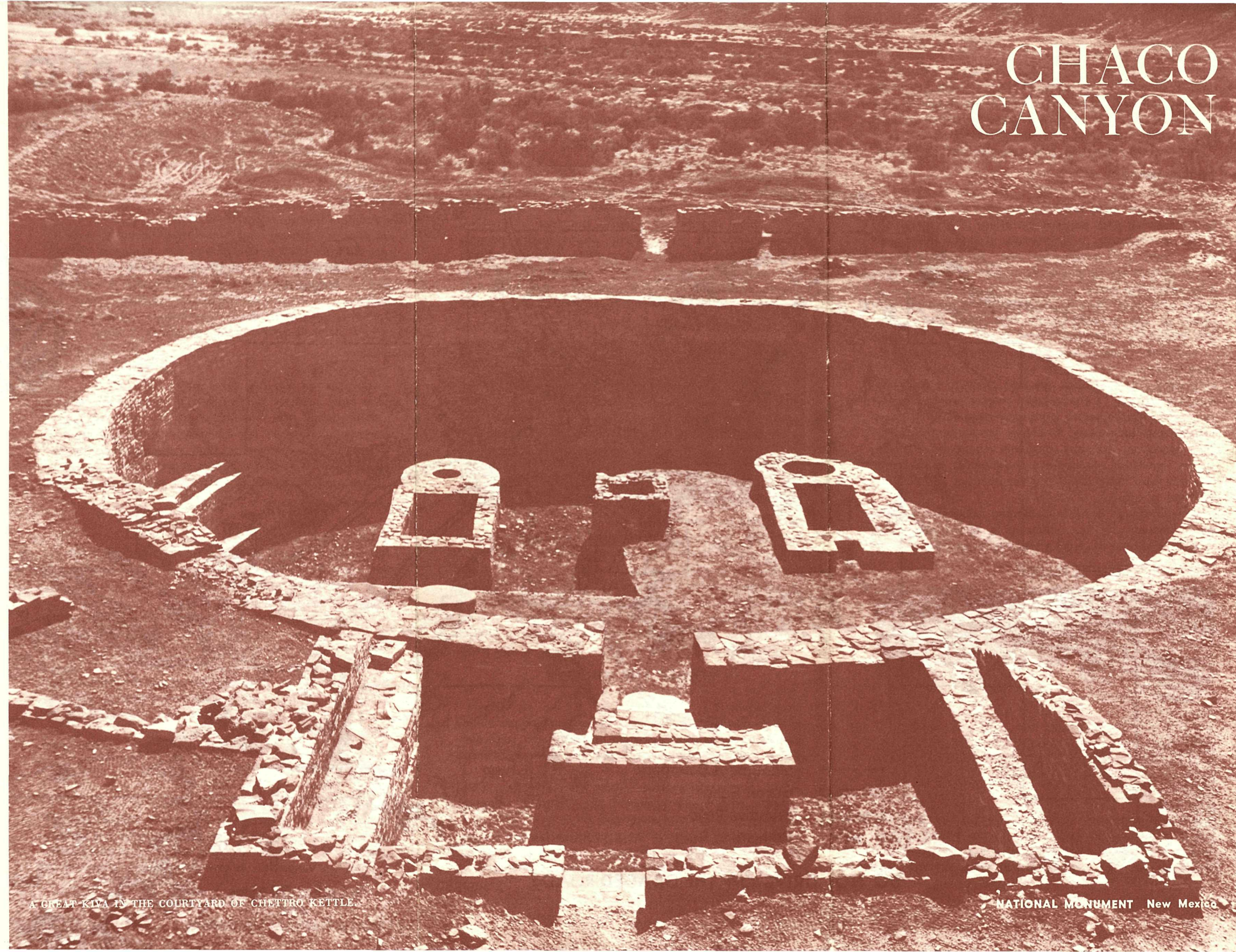
A GREAT KIVA IN THE COURTYARD OF CHETTRO KETTLE

Other units of the National Park System that are within a day's drive of Chaco Canyon also preserve outstanding archeological sites. Among them are Aztec Ruins National Monument in New Mexico, Canyon de Chelly (pronounced Shay) and Navajo National Monuments in Arizona, Hovenweep National Monument in Colorado and Utah, and Mesa Verde National Park in Colorado.