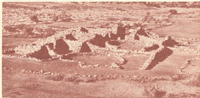
DEVELOPMENTAL PUEBLO NEAR CASA RINCONADA

The plants of Chaco Canyon are typical of the lower ranges of the Upper Sonoran life zone. Stands of juniper cover the higher mesas, and fourwing saltbush and greasewood predominate in the alkaline soil of the canyon floor. In the deep arroyos where there is slightly more moisture, cottonwood, willow, and the introduced tamarisk (saltcedar) thrive. Gramagrass, Indian ricegrass, rabbitbrush, sagebrush, and many other small plants are common throughout the monument.