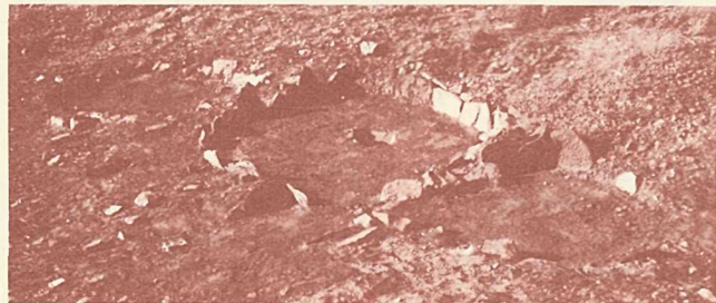
RUINS OF A PITHOUSE WITH STORAGE ROOMS.

The information station at Pueblo Bonito houses a small display of prehistoric remains and serves as a focal point