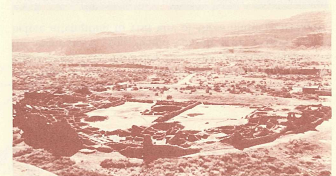
PUEBLO BONITO (BEAUTIFUL VILLAGE).

With the construction and expansion of the great pueblos, which began in the 10th century, rooms and kivas were made larger and walls were extended in height to provide for additional floor levels. Smaller pueblos were being built and occupied at the same time the great ones were being expanded.