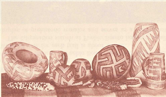
CHACO BLACK-ON-WHITE POTTERY.

excavated Great Kivas are found in Chetro Kettle. The most outstanding, however, is solitary Casa Rinconada, which is 64 feet in diameter. Another earlier solitary kiva is Kin Nahasbas, which is on a slight elevation near Una Vida.