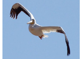
American White Pelican