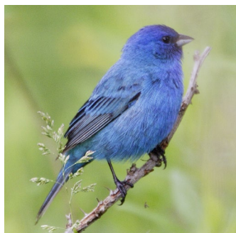
Indigo Bunting

from the City of Sulphur. The Multi-Use Trail System crosses this area, and is the best place to view prairie species such as Northern Bobwhite, Eastern Meadowlark, Indigo Bunting, and Scissor-tailed Flycatcher.