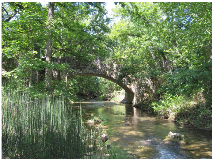
The Lincoln Bridge in the Platt Historic District

When Platt National Park was established, the landscape was very open, partially due to natural causes, and partially due to settlement. In the 1930s, the Civilian Conservation Corp built many of the trails, buildings, roads, pavilions, dams, and campgrounds still in the Platt