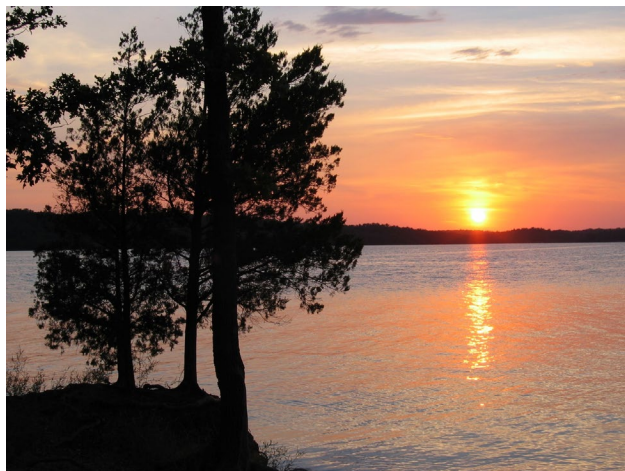
Lake of the Arbuckles

in 1976 the two parks were combined into Chickasaw National Recreation Area. Some lands were added to help connect the two areas, which was completed with the 1983 transfer of Veterans Lake