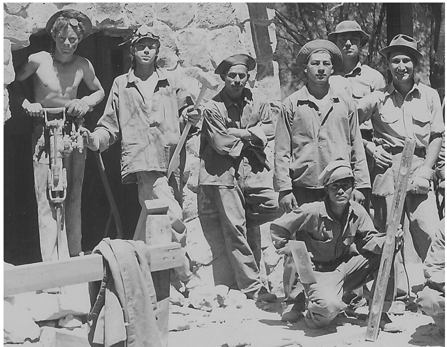
Figure 1. Civilian Conservation Corps enrollees were unemployed, young men aged 17 to 25. Working under experienced foremen, they gained valuable trade skills and a work ethic. In this image, these enrollees display an evident pride in their abilities as they enlarge Chiricahua's original two-room ranger station into a more efficient interpretation center, administrative building, and museum in 1937.

But landscape needed more than one man to open it up. The Great Depression with all of its associated misery created that opportunity. The CCC work program was a signature program of President Roosevelt's New Deal—the largest social experiment, designed to lift the country out of the Great Depression. The CCC hired unemployed young men, taught them skills and a work ethic, and, with respect to park lands, developed recreational facilities across the country (Figure 1). In Arizona, because of New Deal work programs like the CCC, the 1930s saw more coordinated federal and state-led development than at any other decade in the history of the state. 4