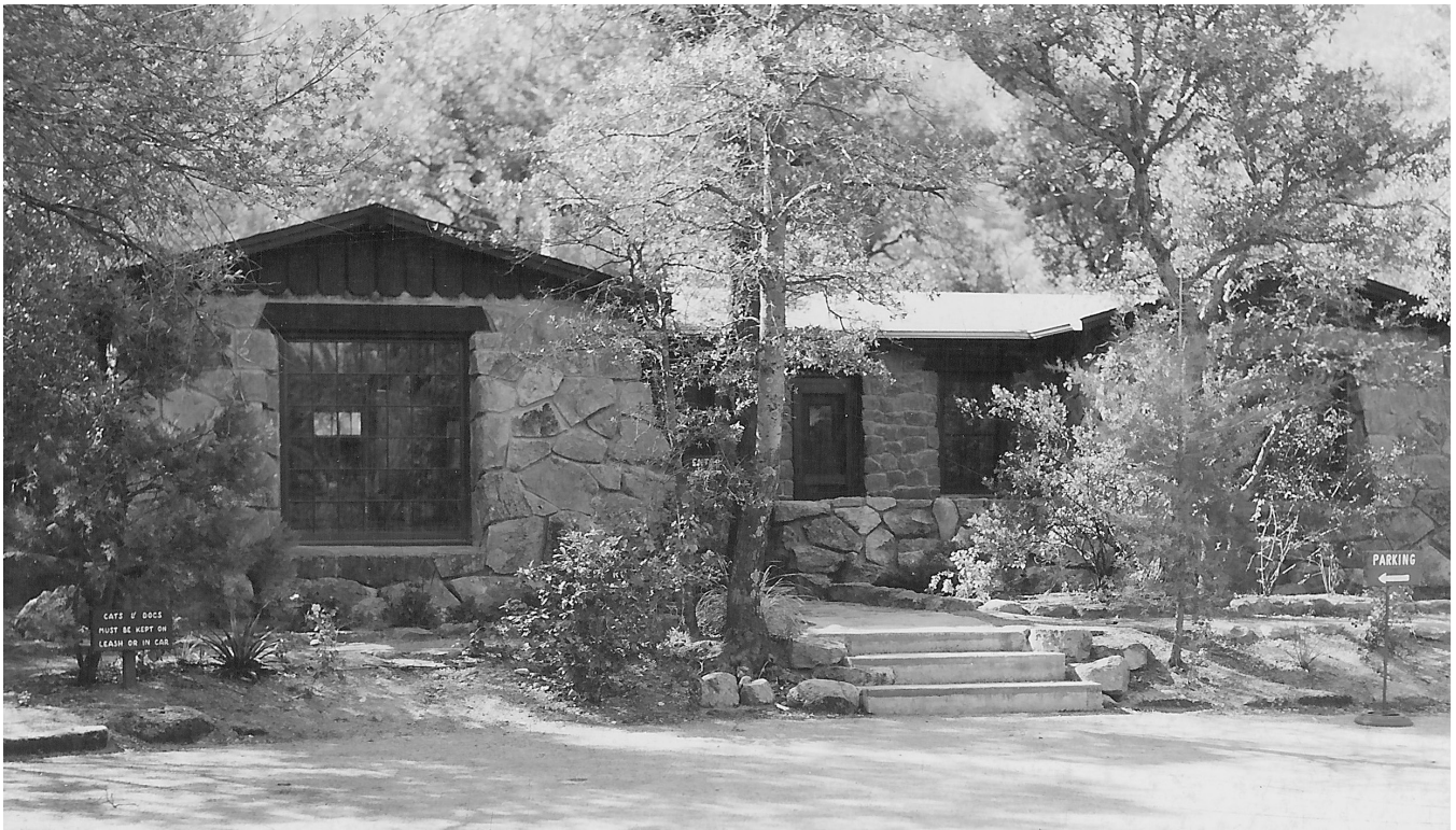
Figure 2. Chiricahua’s administration building and museum were constructed by CCC enrollees using carefully quarried stone and assembled following NPS design principles of rustic architecture. Hundreds of visitors walk past this building to enter the Mission 66 visitor center addition yet there is no interpretation about its origins.