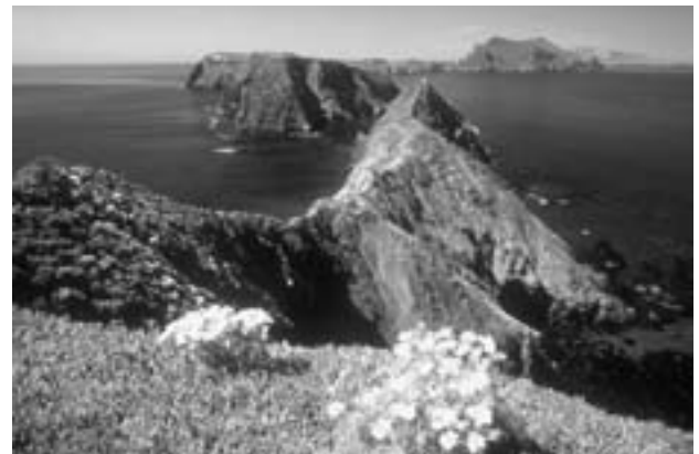
Inspiration Point, timhaufphotography.com