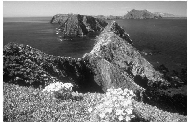
Inspiration Point