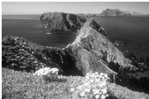
Inspiration Point