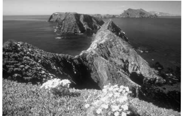
Inspiration Point