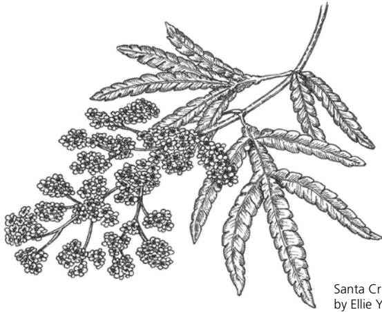
Santa Cruz Island Ironwood by Ellie Yun Hui Tu

Channel Islands National Park supports a diverse terrestrial flora, including many rare, relict, and endemic species, as well as many nonnative species. Numerous plants are rare on the islands but have a wider distribution on the mainland. On the other hand, due to environmental conditions and isolation from the mainland, many of the plants that are native on the California mainland do not grow here. A total of about 801 plant taxa, including species, subspecies, varieties, and forms, have been identified in the park, of which about 580 are native and 213 are alien or non-native. (Note: the discrepancy between the sum of native and non-native and the total sum is because for several species their native/non-native status is unknown.)