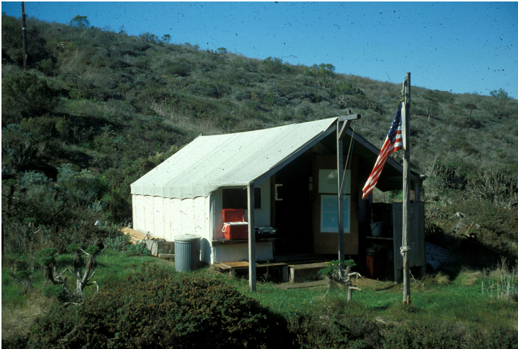
Fig. 5. Wood-framed tent cabin built in 1979 in Nidever Canyon.

While the tent cabins provided shelter from the wind and rain, they also provided habitat for mice. Log entries frequently recounted the saga of mice crawling around in the stove and dishes, and various schematics for mousetraps were designed and illustrated.