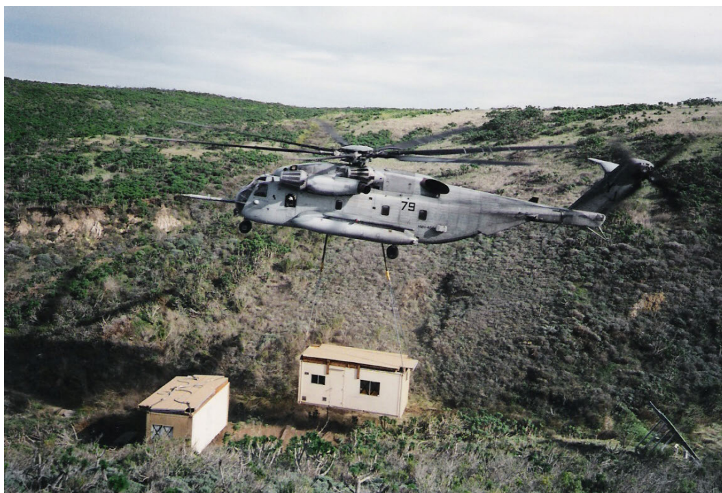
Fig. 7. U.S. Marine Corps helicopter removing the Conex boxes in December 1997.

could plug into a docking station in which they could be charged and connected to an external antenna. Keeping the batteries charged was a regular issue. The antennas mounted on poles on the west side of the canyon were essential to communications from the ranger station on the canyon floor.