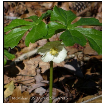
Jeff McMillan, USDA-NRCS PLANTS