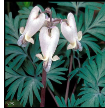
Squirrel Corn ( Dicentra canadensis )