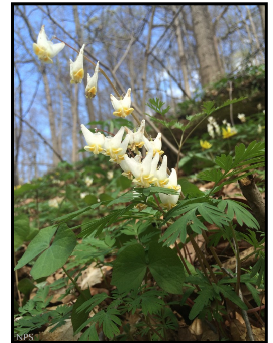
NPS Dutchman's Breeches