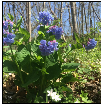
Virginia Bluebells ( Mertensia virginica )