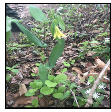
Bellwort ( Uvularia sessilifolia )