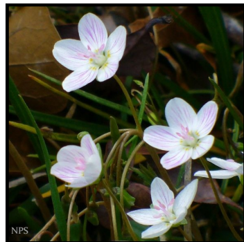
Spring Beauty ( Claytonia virginica )