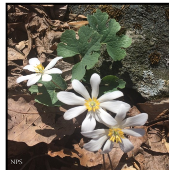
Blood Root ( Sanguinaria canadensis )