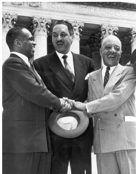
George E.C. Hayes, Thurgood Marshall, and James M. Nabritt (left to right) on the steps of the Supreme Court Building in Washington, D.C. after the Brown verdict was read.

The event will take place Saturday, May 15, 2004 at 10:00 a.m. at the Harry R. Kendall Science and Health Mission Center at Philander Smith College in Little Rock. For more information, please call us at (501) 374-1957.