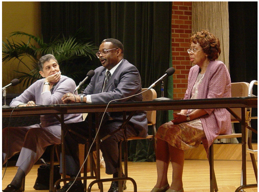
Three of the Little Rock Nine, l to r, Carlotta Walls LaNier, Jefferson Thomas, and Thelma Mothershed Wair, speak to UALR's Brown v. Board class.