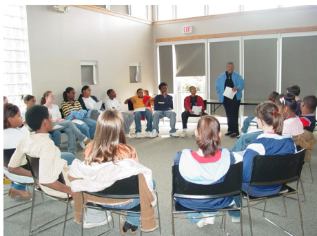
Minnijean Brown (one of the Little Rock Nine) speaks to students about non-violence.

Three years had passed since Little Rock Central High School was desegregated in 1957, but some Southern schools remained segregated. Ruby Bridges was six years old when she integrated William Frantz Elementary School. She had to be escorted to school daily by federal marshals to ensure her safety. Outside the school was an angry mob chanting hateful words opposing integration.