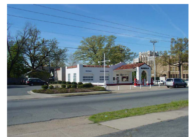
Visitor Center before sign installation.

The new sign, installed in early November, was designed in a style that mimics the architecture of the sculptures in our Commemorative Garden. The base of the sign and planter was constructed by East-Harding, Inc. and Sonny Fish Masonry. The sign itself was fabricated by Sign Design from Colton, South Dakota.