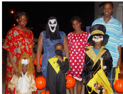
Neighborhood trick-or-treaters join in the fun at Big Boo!seum Bash.

Halloween was very fun! Over 600 people participated in our 9 th annual Big Boo!seum Bash! Ghosts, goblins, witches, princesses, cats and many more creative characters landed at Little Rock Central High School National Historic Site on the eve of October 31, 2003. Our site was taken back in time with our “back to the fifties” event. Some were spotted wearing poodle skirts and bobbi socks! Others danced the shuffle to Elvis and James Brown!