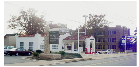
New Visitor Center sign.