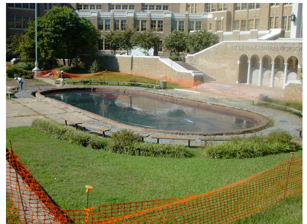
New reflecting pool under construction.

On September 26, 2004, Little Rock Central High School National Historic Site, together with the Little Rock School District and AARP Arkansas, commemorated the 47 th anniversary of the Central High crisis and dedicated the newly restored reflecting pool in front of the school. Nearly 600 people gathered to remember the courage of the Little Rock Nine—the nine African-American teenagers who desegregated the school in 1957—and commemorate one of the most important events of the Civil Rights Movement. United States Senator Mark Pryor, who attended Central High before moving to Washington, D.C. with his family when his father was elected to the Senate, gave the keynote address. Other speakers included Superintendent Mike Madell, Central High Principal Nancy Rousseau, and Little Rock School District Superintendent Dr. Roy Brooks.