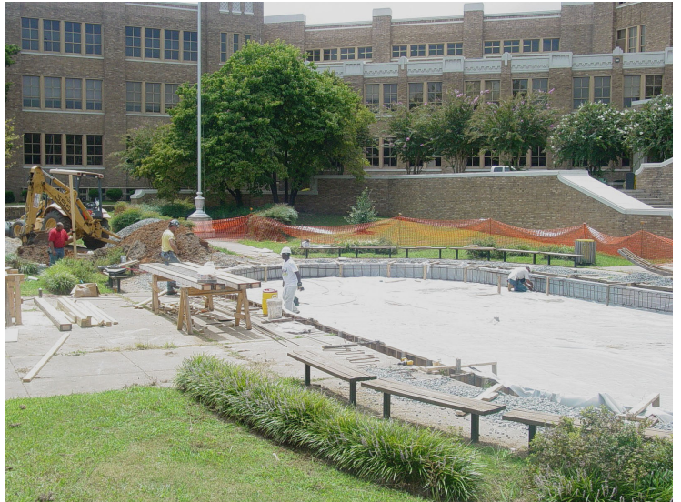
Reflecting pool under reconstruction, August 23, 2004.