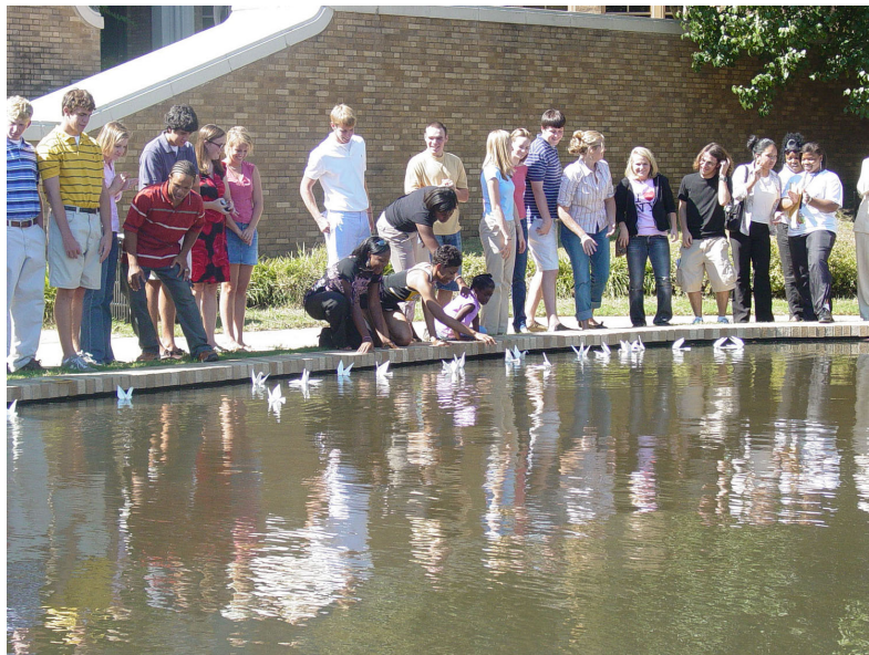
Central High School students release origami cranes into the new reflecting pool.