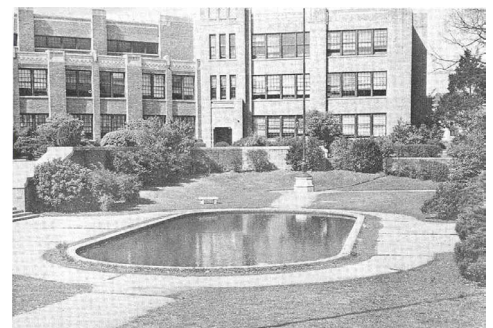
Black and White Photos Above: The original Central High Reflecting Pool, The Pix yearbook.