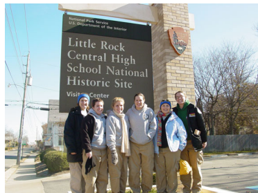
Americorps volunteers from Children's Hospital pose after a cleanup day at the site, December 10, 2005.

Thanks to everyone for volunteering for National Night Out 2006. Over 400 people attended the evening, which consisted of fun filled and educational activities, including a special appearance from Smokey the Bear .