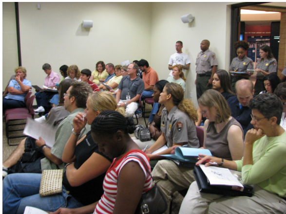
Volunteers and staff participate in a briefing meeting the night before the dedication ceremony.

The historic site staff would like to thank all the wonderful volunteers who helped make the Visitor Center dedication ceremony a great success! Organizations like City Year, the Black Firefighters Association, UALR Public History Program, the Equal Employment Opportunity Commission, Little Rock School District, National Association of Social Workers, and many generous individuals donated their time and talents to making the event a great success.