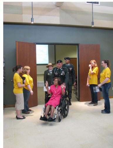
Volunteers helped keep the "Green Room" operational before and during the ceremony.

Are you interested in volunteering? We are looking for volunteers in the following areas: Writing, Interpretation and Educational Programs, Research, Photography and Videography, and Landscaping.