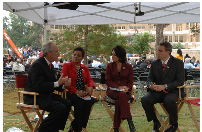
Left: SNCC's Freedom Singers perform during the dedication ceremony. Right: KATV broadcasts live from the 50th Anniversary events with Secretary Kempthorne.