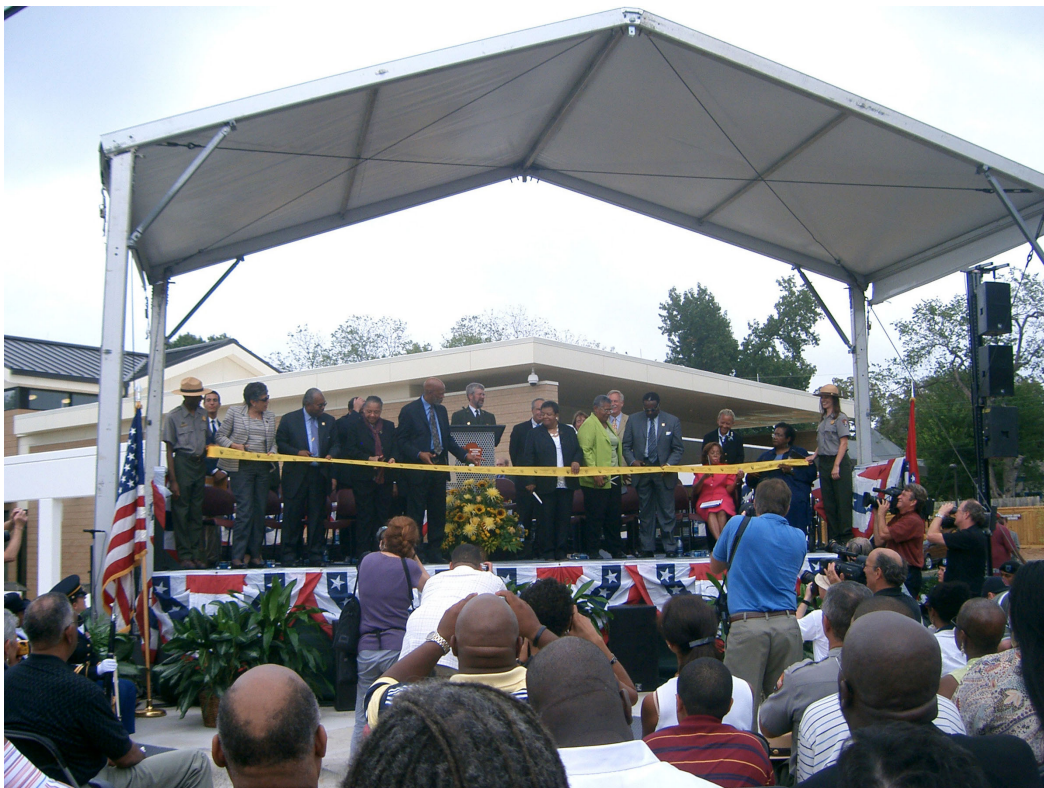
Members of the Little Rock Nine prepare to cut the ribbon during the dedication ceremony, September 24, 2007.