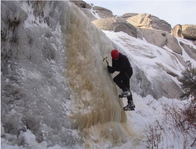
Site 33 bouldering

The summer rock route “Water Streak” occasionally freezes up providing one of the longest routes in the City..almost 70 meters. Using a scope or binoculars from Bath Rock to check conditions is recommended.