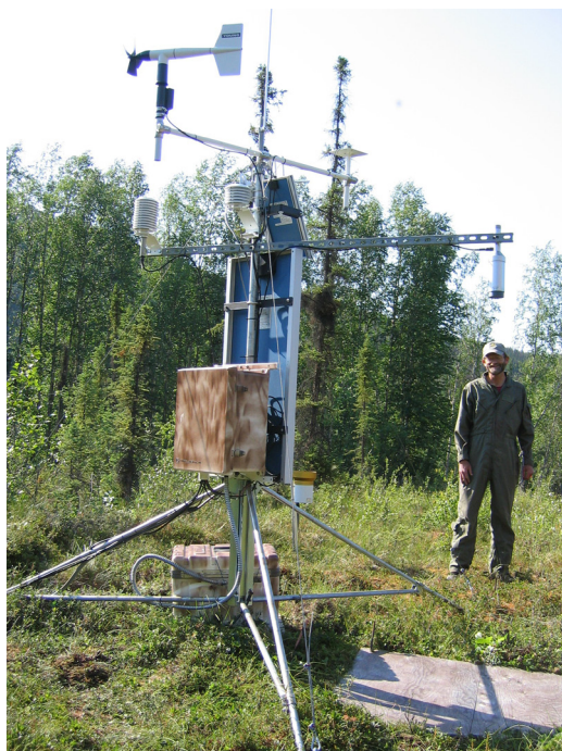
A researcher with the National Park Service conducts routine maintenance on a remote area weather station located in Yukon-Charley Rivers National Preserve.

the next few years is to maintain the integrity of the new stations, promote the use of data for ecological and climatic analysis, improve data query tools and integrate the NPS climate products with other climate change research and monitoring efforts. The NPS recently partnered with the PRISM (Parameter-elevation Regressions on Independent Slopes Model) Climate Group at Oregon State University to update the gridded monthly and annual precipitation and temperature data sets for Alaska for the 1971 - 2000 climate period. These maps help estimate variations in temperature and precipitation around existing climate stations and will be used to update the projected climate change scenarios for the national park units in the state.