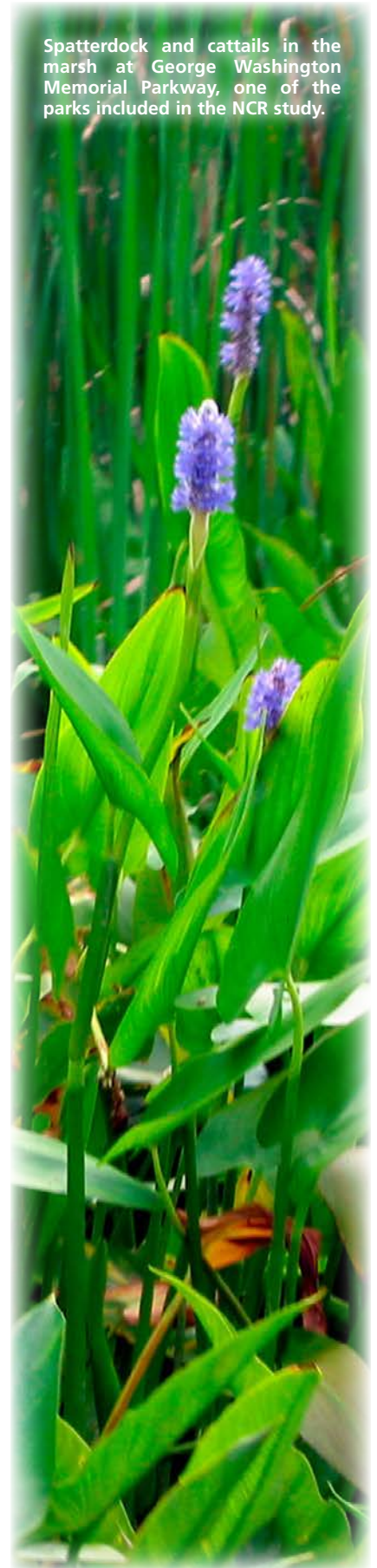
Spatterdock and cattails in the marsh at George Washington Memorial Parkway, one of the parks included in the NCR study.