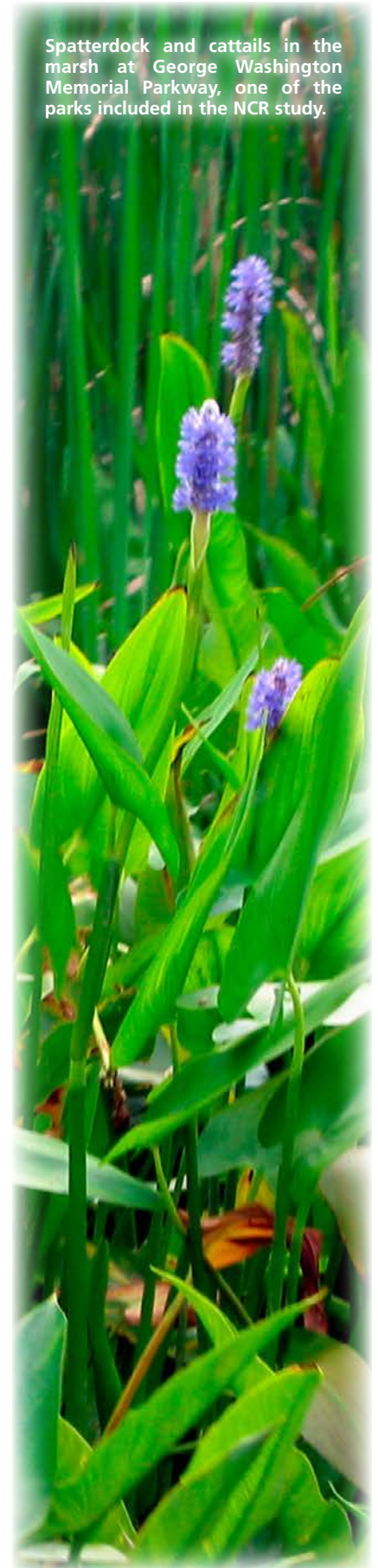
Spatterdock and cattails in the marsh at George Washington Memorial Parkway, one of the parks included in the NCR study.