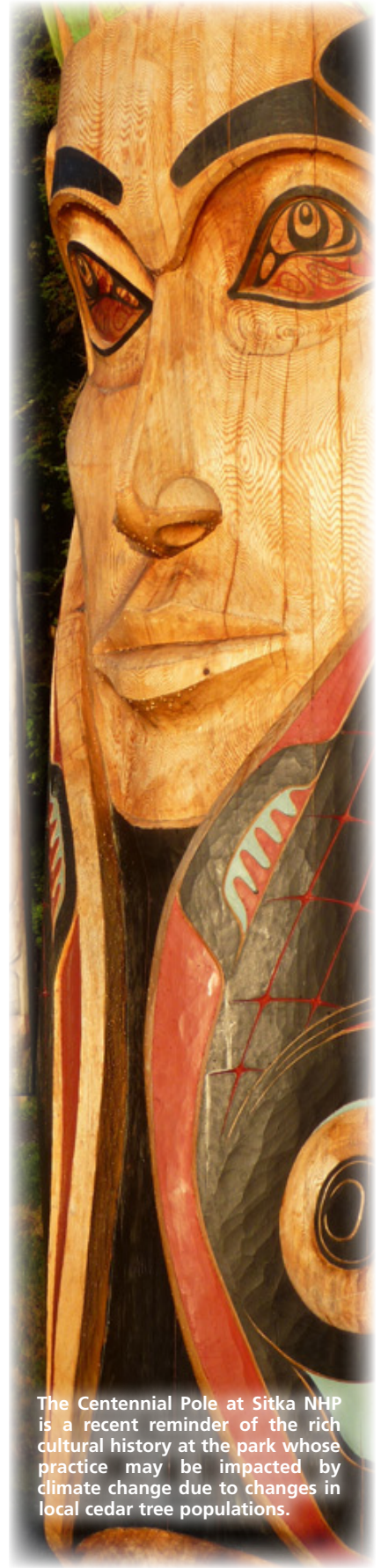
The Centennial Pole at Sitka NHP is a recent reminder of the rich cultural history at the park whose practice may be impacted by climate change due to changes in local cedar tree populations.