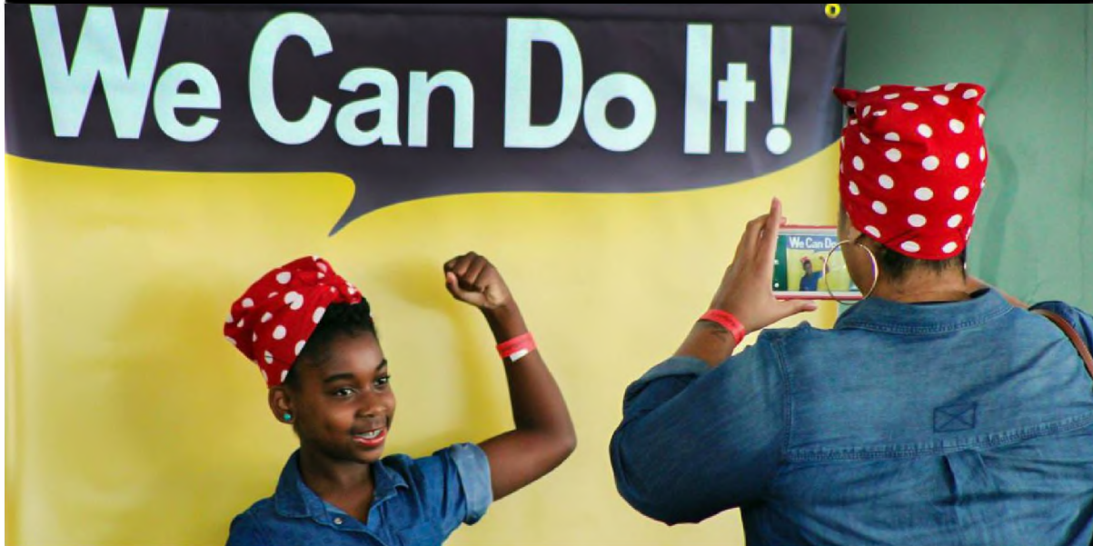
A child has their photo taken in front of a "We Can Do It" sign.

During WWII, the country mobilized around a common cause. The famous "We Can Do It" poster has become a symbol for the way the U.S. changed in order to solve a shared problem. What cause do you think your country should mobilize around next?