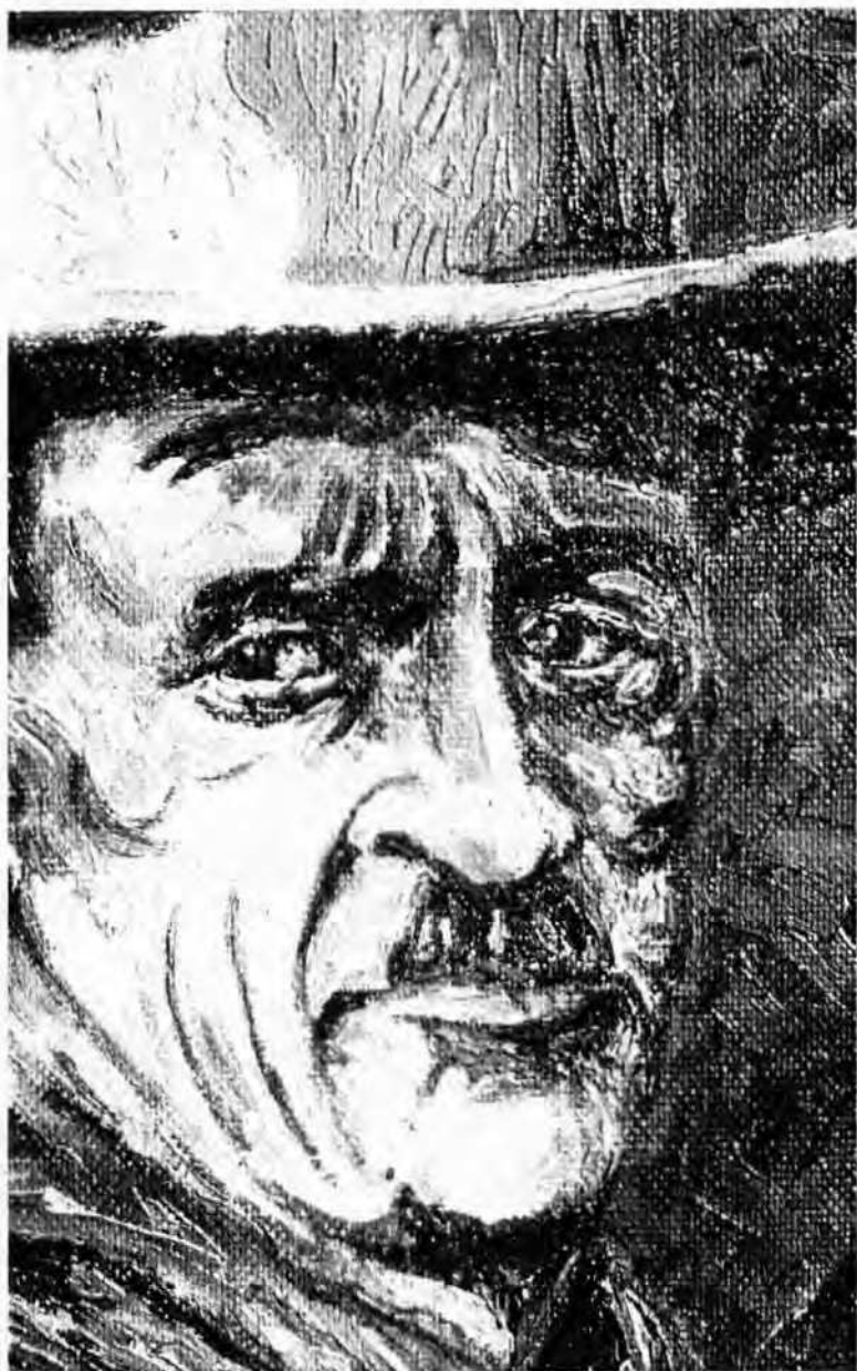
Painting of John Otto by Al Look