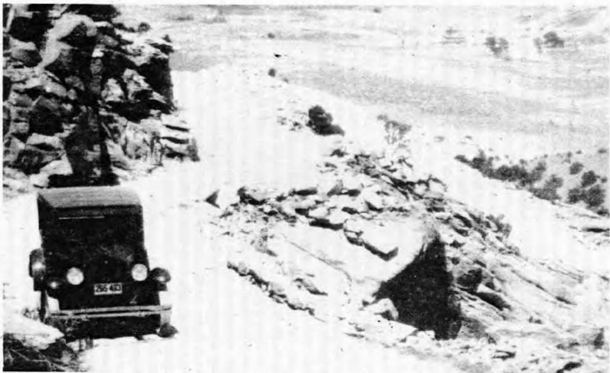
Automobile climbing Serpent's Trail