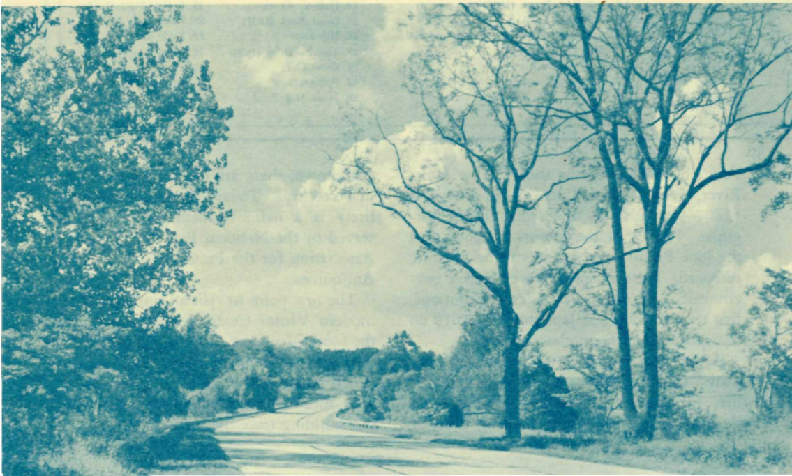
A parkway vista.