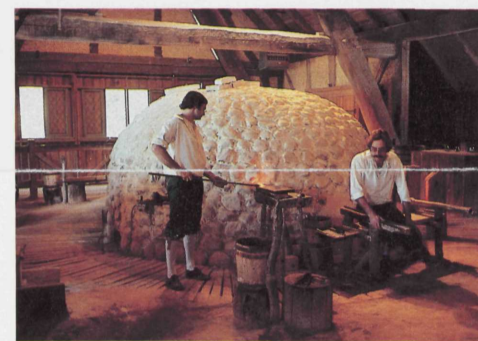
The first glass manufactured by Englishmen in the New World was produced at the small glass factory at Jamestown in 1608. Today, at the reconstructed Glasshouse near the park entrance, craftsmen show visitors how it was done.

Jamestown lies at the western end of the Colonial Parkway. The town itself no longer exists except in the pages of history books and in the imagination. During its brief life, however, it wore many faces: a tiny fort at the edge of the wilderness; a small community growing to meet the needs of the land; the center of religious, economic, social, and political life in a prospering colony; and the scene of violence and