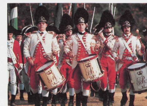
Each year on October 19, the anniversary of the British surrender, Yorktown is the scene of patriotic festivities and exercises commemorating the last major battle of the American Revolution.

The events of the siege and the story of the Town of York are set forth in a theater program and exhibits at the visitor center. Among items on display are military tents used by Washington during the Yorktown campaign, part of a reconstructed British frigate with objects recovered from the York River, and dioramas depicting aspects of the siege. The Siege Line Overlook on the roof of the visitor center affords a panoramic view of strategic points on the battlefield. National Park Service personnel are available to help plan your visit and answer questions. An admission fee to Yorktown Battlefield is payable at the visitor center.