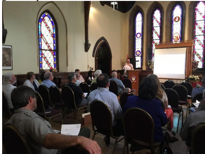
(Community Meeting -)

Last summer, the NPS worked on a combined project for multiple parks to develop some proposed architectural and engineering studies of various historic rehabilitation projects. Coltsville was among those parks chosen to work with Davis Brody Bond (DBB), the architects who designed the 9/11 Memorial in New York City, to get some preliminary potential designs for what the future Coltsville Visitors Center might look like and cost to be developed. It is important to note that these are conceptual layouts for planning purposes. The closer the park gets to establishment and actual construction many more sessions will take place to gather input.