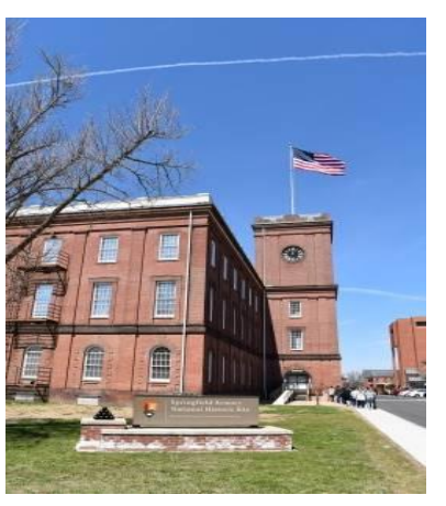
(Springfield Armory)

6:30 – 8:30pm: Simply Swing Band Location: Springfield Armory NHS