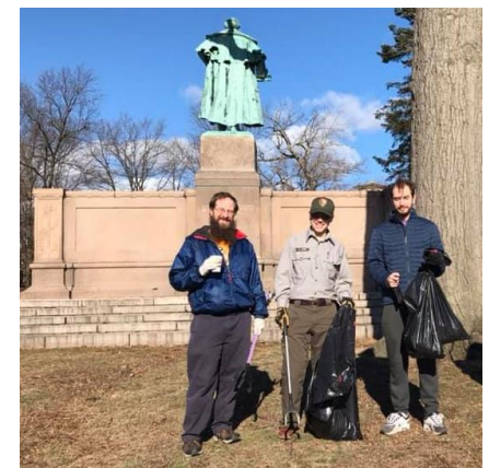
(Colt Park Clean up)

6-8pm: Sunset Sounds Concert Series Location: Butler-McCook House and Gardens