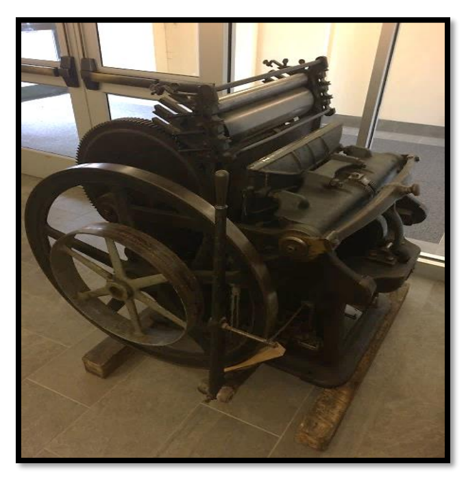
A Colt's Armory Press, possibly a "Quarto Medium size 2"

Of the numerous products produced by the Colt factory, in addition to firearms, one of the most diverse and intriguing is "the Colt Press," a sample of which remains in the East Armory to this day.