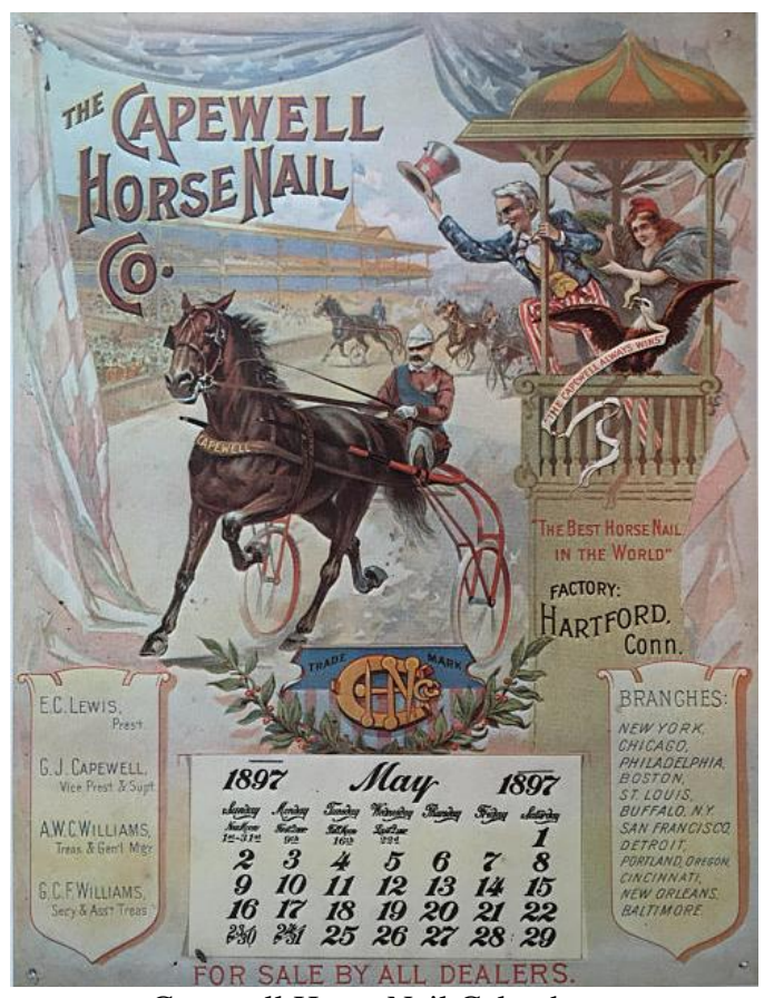
Capewell Horse Nail Calendar