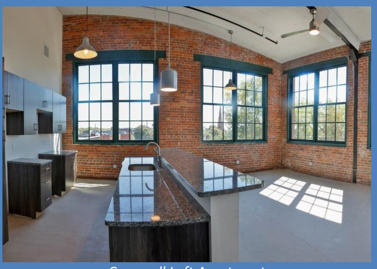
Capewell Loft Apartment

The first multimillion dollar step for the Capewell project was to remediate the environmental issues related to the historic site. Then CIL created 72 luxury "Capewell" lofts, of which 20% are income restricted. The lofts went on the market in November of 2016, and by March of 2017 all of these highly desirable apartments have been rented.