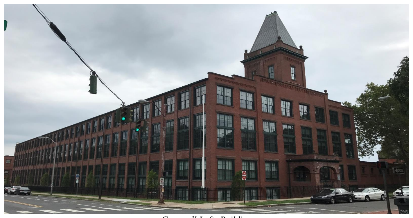
Capewell Lofts Building