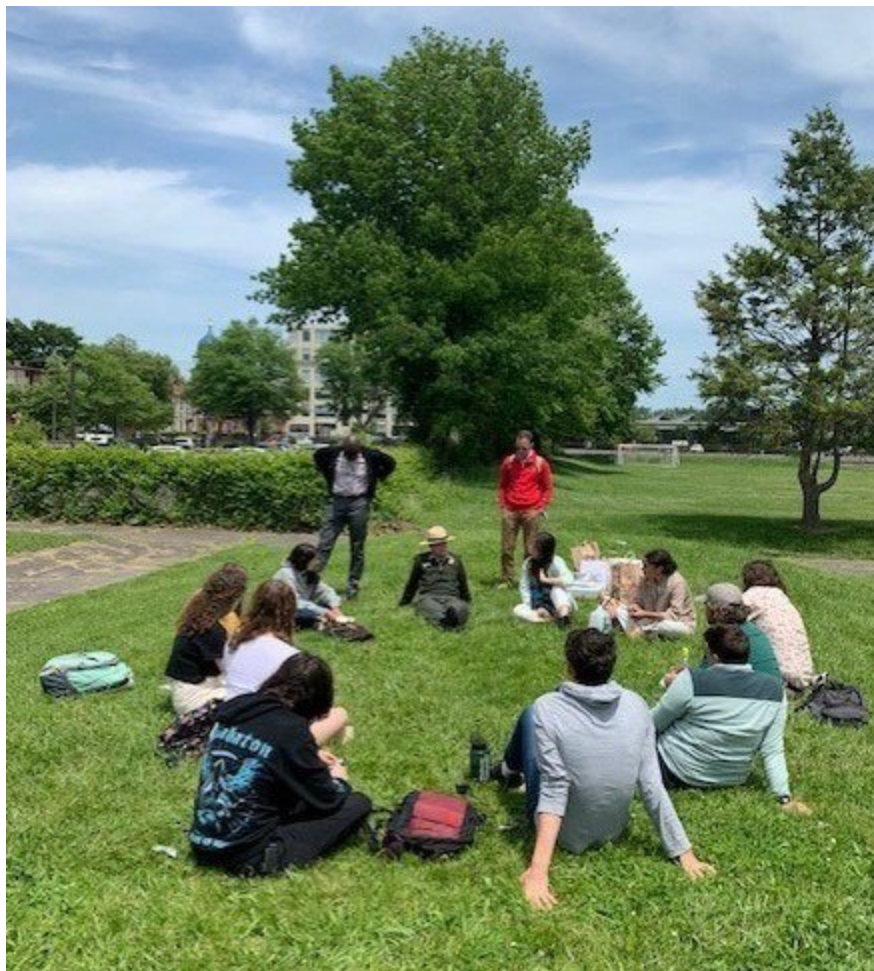
Wesleyan University students in Colt Park