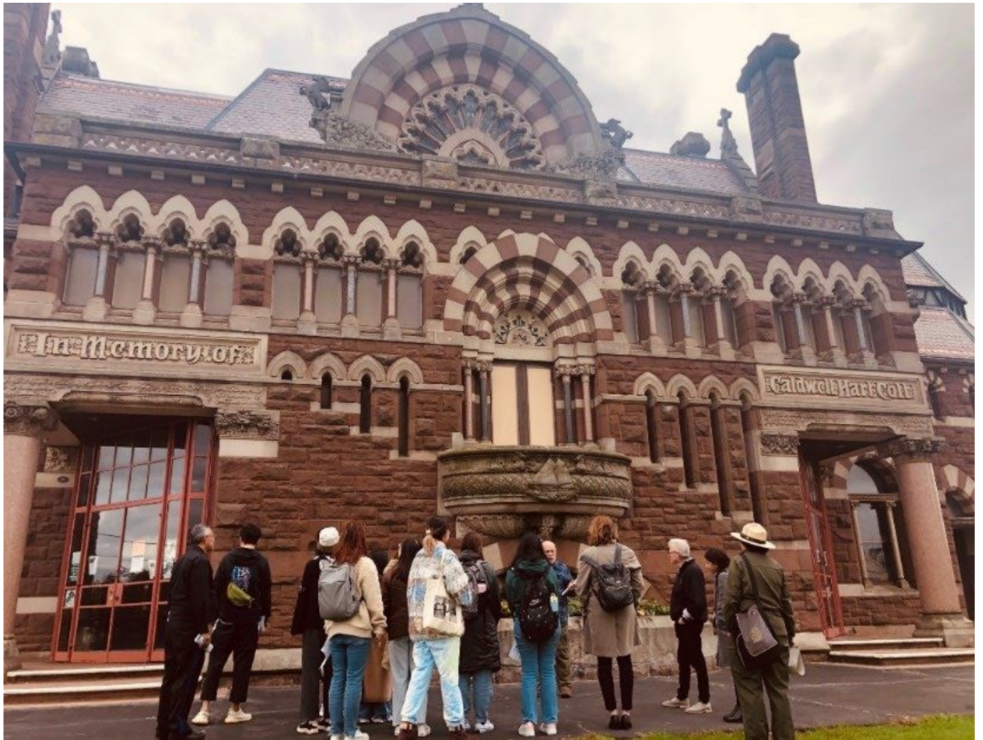
RISD students on tour at the Caldwell Hart Colt Memorial Parish Hall.