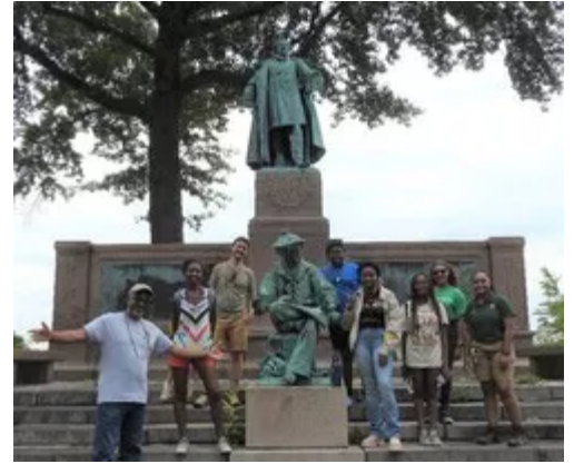
Youth Stewards in Colt Park NPS

We are excited to share that we will welcome anew Community Volunteer Ambassador in February. The goal for this position is to continue the development of community outreach programs with other agencies, partner and youth organizations in both Hartford and Springfield. We strive to engage youth through stewardship programs designed to address climate justice and develop leadership skills. This involves identifying partners, coordinating opportunities, sharing information, recruiting participants, and promoting the events with internal and external audiences.