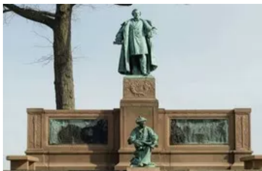
The Samuel Colt Monument NPS

Forging agreement that meets the needs of both public and private interests is complex. But everyone remains committed to reaching an agreement that allows for the donation of the brownstones and preservation of the Armory complex and planning for the formal establishment of the park.