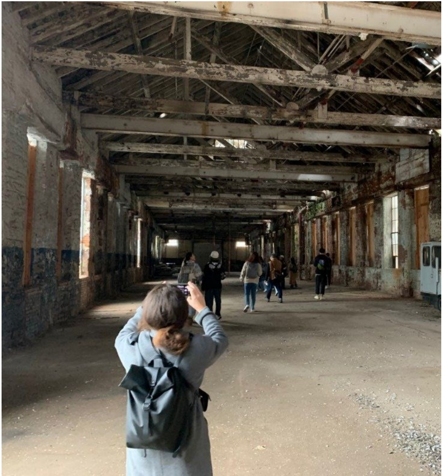
RISD students on tour at Building 8.