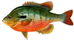
Redbreast Sunfish ( Lepomis auritus )