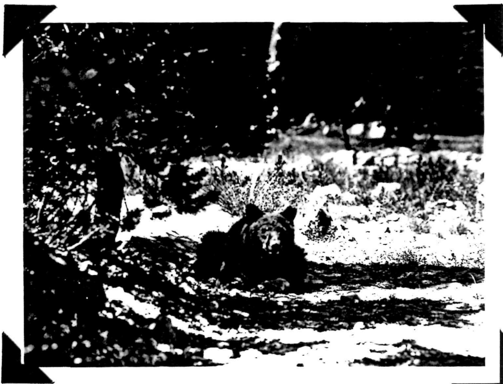
Fig.3, Neg.#324-12. The "boss bear took it easy while waiting in the shade for a chance to beg food from park visitors. Dixon's "Bears at Crater Lake", Dec. 1944.