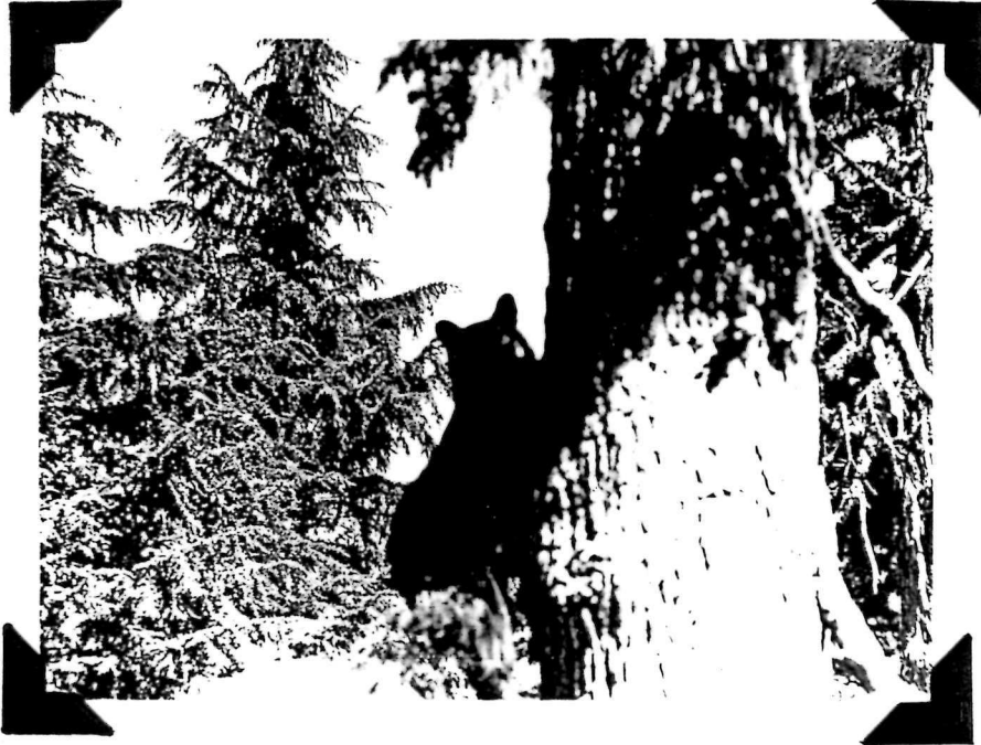
Fig.5, Neg.#41-8. The cubs climbed trees and waited until the big bears had finished feeding. Dixon's "Bears at Crater Lake", Dec.1944.

Several bear fights resulted when bears came too close to each other at the garbage pit. (See Fig.6)