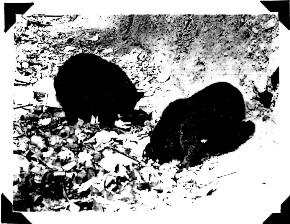
Fig.4, Neg.#326-7. Certain bears were willing to share the garbage. Note rear bear eating grease-soaked paper, an unnatural diet difficult even for a bear to digest. Dixon's "Bears at Crater Lake", December, 1944.

Certain bears shared their garbage and permitted other bears to feed unmolested within a few feet of them (See Fig.4) but in the majority of instances the biggest bear ate his fill first then the next largest and so on down the line. The yearlings and the cubs waited either up a tree (See Fig.5) or at the end of the line.