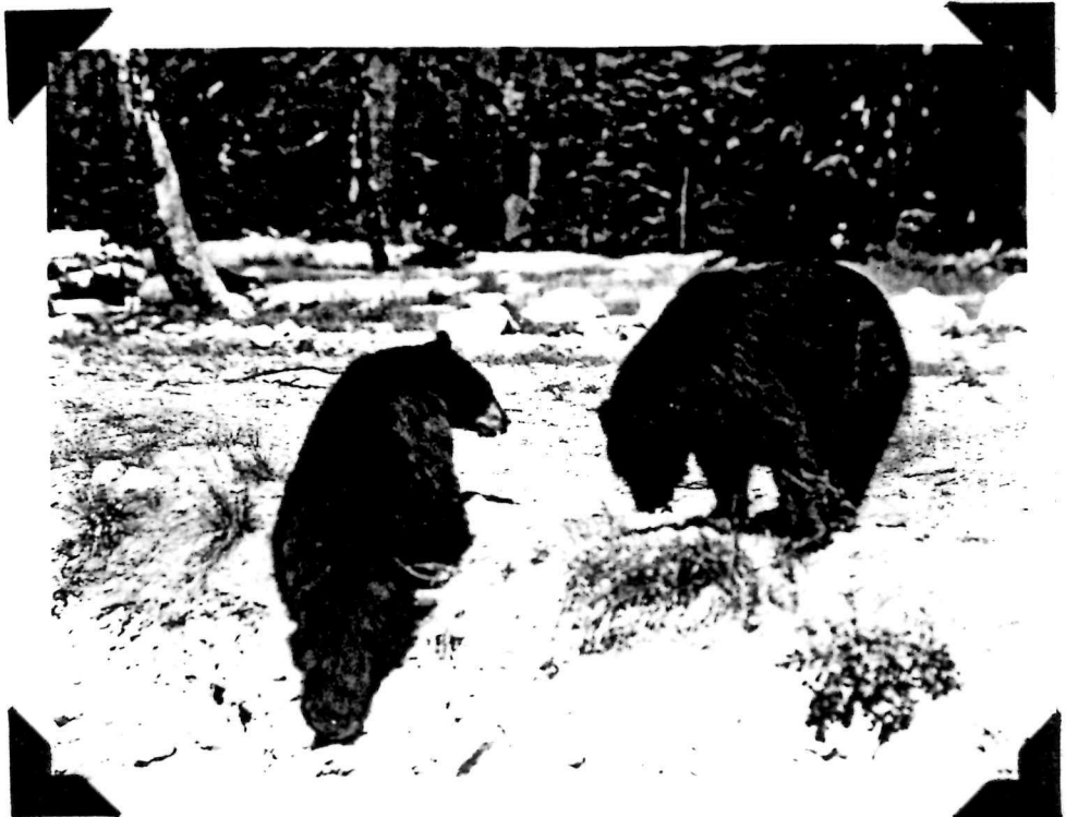
Fig.6. Neg.#326-4. You keep out of my garbage or I'll tear you apart. Dixon's "Bears at Crater Lake", Dec.1944.

Several bear fights resulted when bears came too close to each other at the garbage pit. (See Fig.6)