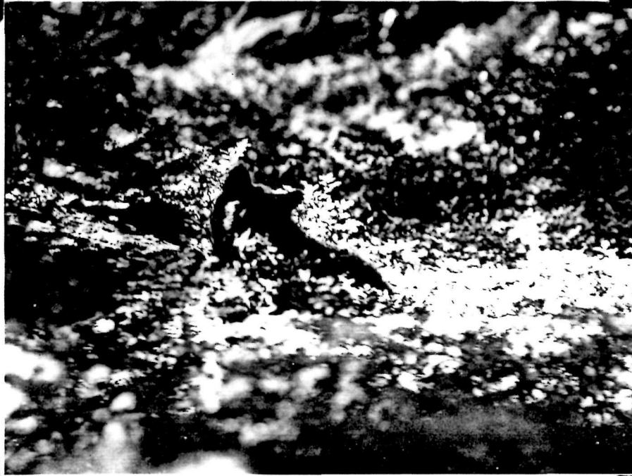
Fig.9, Neg.#325-10. In gathering huckleberries, this bear would take a sprig 12 to 20 inches long in its mouth. Then, with a side swipe of its head strip the berries off the branch and swallow them often without chewing them. Dixon's "Bears at Crater Lake", Dec.1944.

securing several berries plus some green leaves. (See Fig.9). Examination of bear feces indicated that the bears swallowed some huckleberry entire without chewing them.