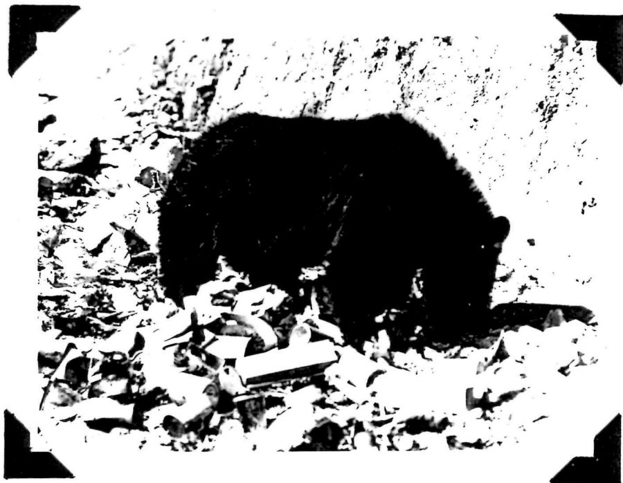
Fig.2, Neg.#41-12. This largest old male "boss" bear always drove the other bears away and so got the choicest bits of garbage. Dixon's "Bears at Crater Lake", December, 1944.