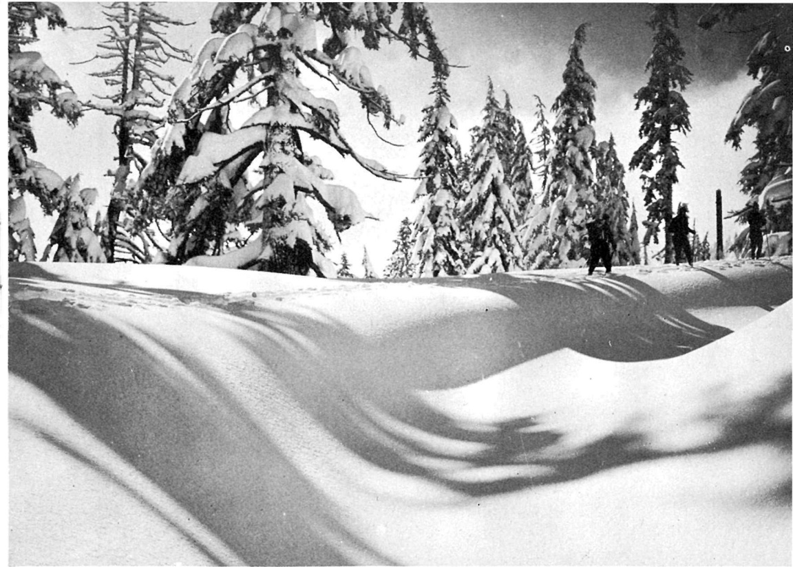
SKIERS ON RIM OF CRATER LAKE.

The Crater Lake National Park Co. offers accommodations for park visitors.