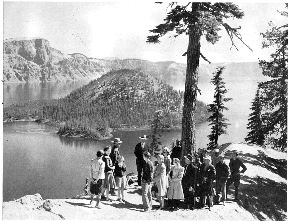
RANGER NATURALIST WITH PARTY OF VISITORS ON THE RIM OF CRATER LAKE.

Glacial ice, carrying sand, pebbles, and boulders, scratches and polishes rock surfaces over which it moves. Glacial polish and thick beds of glacial debris are common around the mountain. They occur on the surface rock and between earlier layers, showing that glaciers existed at various stages in the history of the mountain.