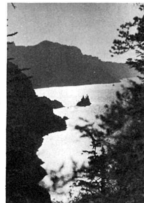
ACCESSIBLE ALL YEAR