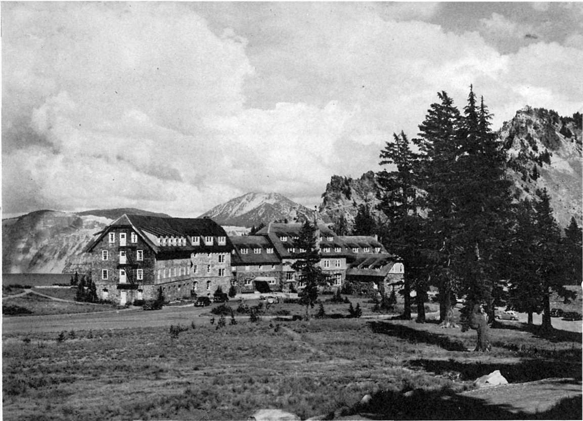
CRATER LAKE LODGE.