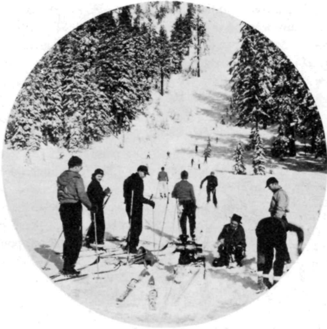
Natural ski run cut by old rock slide.