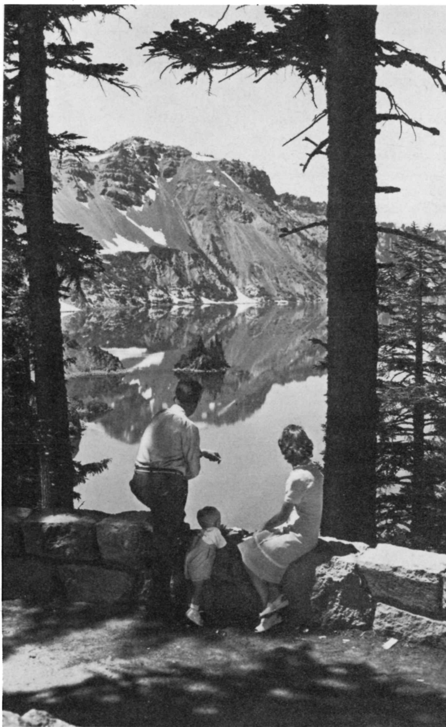
Phantom Ship. Applegate and Garfield Peaks are reflected in Crater Lake.