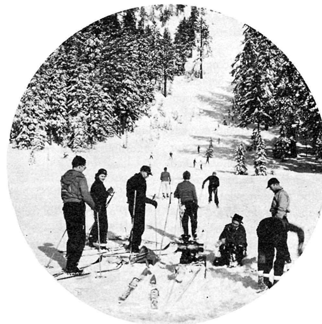
Natural ski run cut by old rock slide.

OTHER PLACES OF INTEREST IN THE PARK AND VICINITY. Hillman Peak,