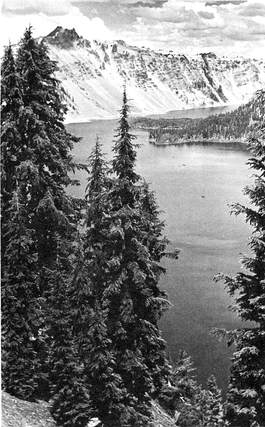
Hillman Peak—Highest Point on Rim of Crater Lake

floor, the lowest part of which is almost 2,000 feet below the surface of the present lake.