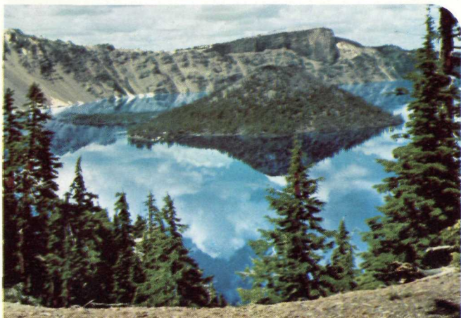
WIZARD ISLAND AND CLOUD REFLECTIONS