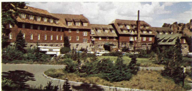
CRATER LAKE LODGE