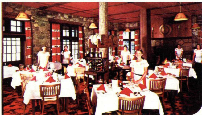
LODGE DINING ROOM