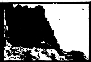
SOUTH ELEV. 8-3-84