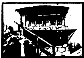
EAST ELEV. 8-3-84