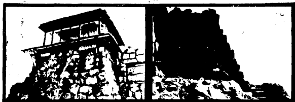
SOUTH ELEV. 8-3-84