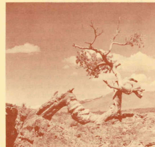
The Triple Twist Tree.

The completed MISSION 66 program at Craters of the Moon has built a visitor center, expanded the campground, and improved the road, parking areas, and utility facilities. Under the program, the staff of interpretive and protective personnel has been increased, and a system of roadside interpretation has been installed.