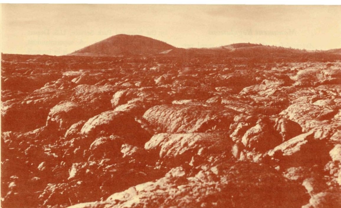
Pahoehoe lava flow near Indian Tunnel.

The very recent flow from North Crater is of special interest because it shows so clearly