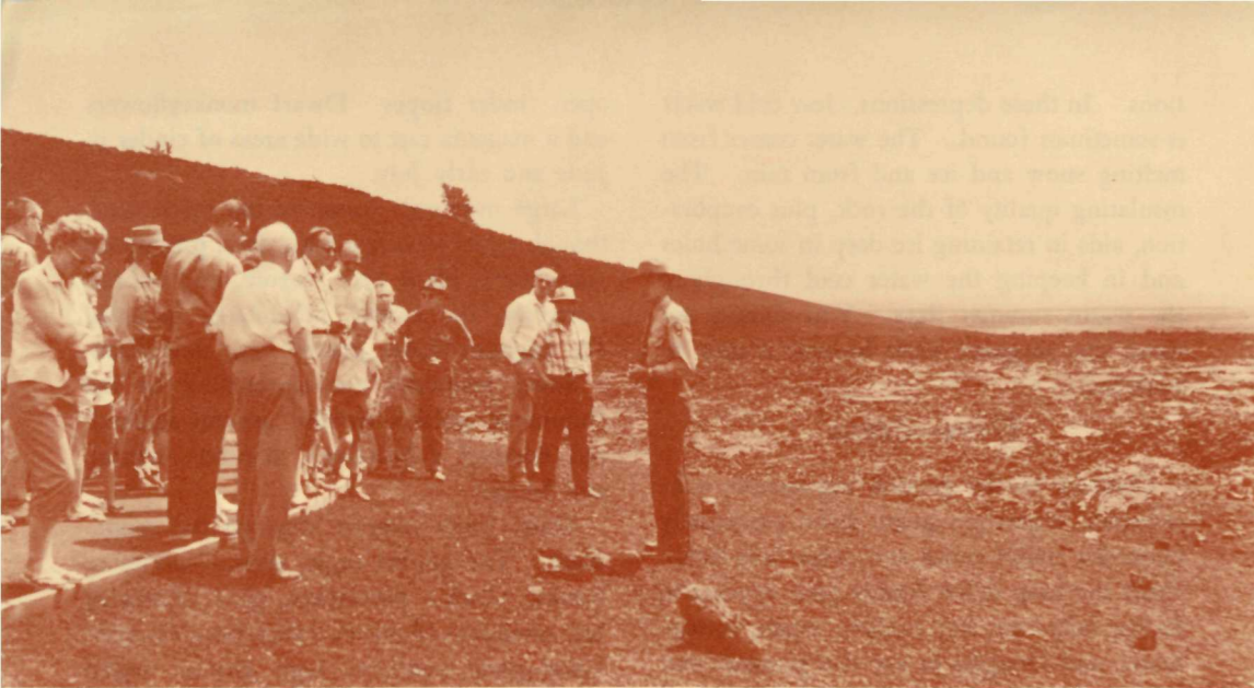
The stop of a naturalist-conducted auto caravan at Big Craters.

as strongholds. At Indian Tunnel there are several semicircular arrangements of stone, the use for which is not known. Arrowheads and other types of stone implements were previously found in this vicinity.