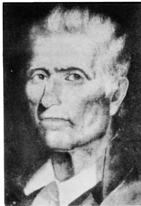
Daniel Boone. A painting by Chester Harding.