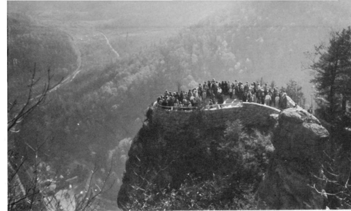
Pinnacle Overlook Terrace.

continued to pass through Cumberland Gap, and in 1796 the Wilderness Road was widened and improved for wagon traffic. The final defeat of the northern Indians and the opening of more direct routes across the mountains, however, eventually diverted most of the travelers. By 1825, a large part of the traffic on the Wilderness Road, which had once echoed with the footsteps of Boone and Clark and the war whoops of the Indian, consisted of livestock en route to eastern markets.