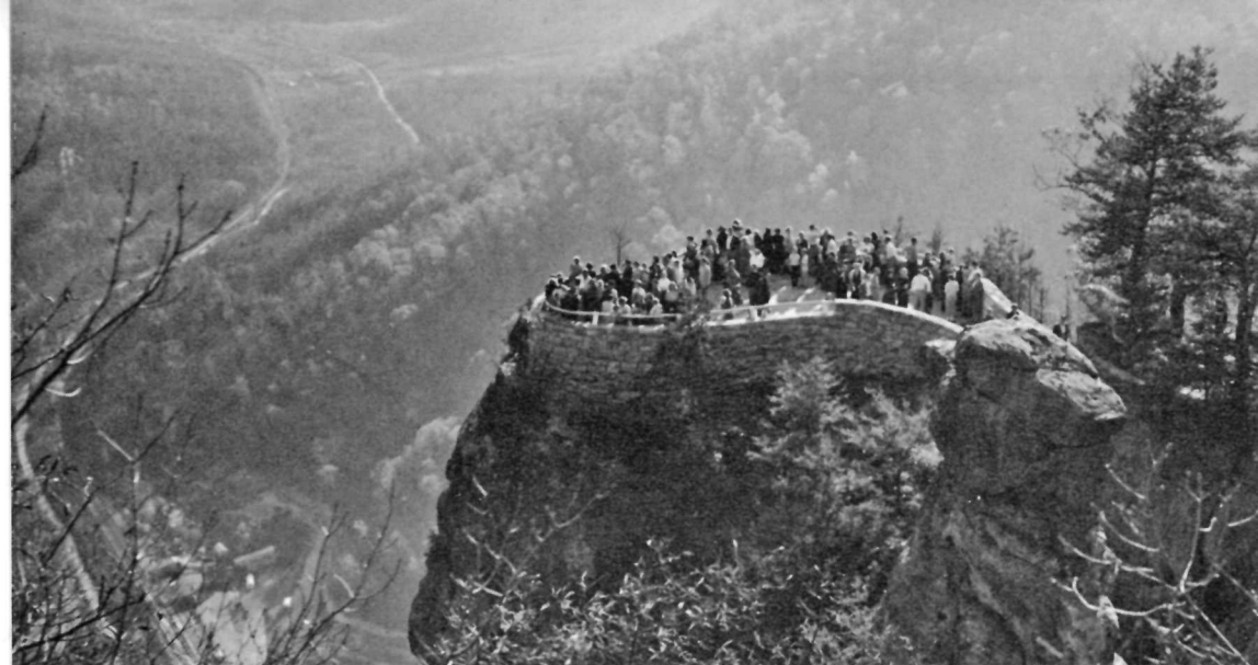
Pinnacle Overlook Terrace.

of the traffic on the Wilderness Road, which had once echoed with the footsteps of Boone and Clark and the war whoops of the Indian, consisted of livestock en route to eastern markets.