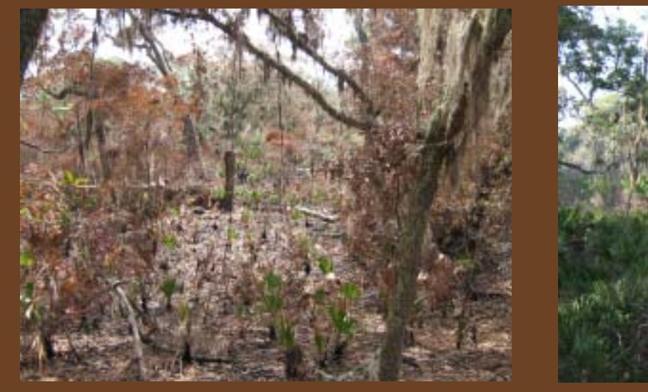
Point 3 taken on 8/25/06